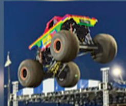
Monster Trucks Wednesday