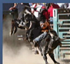
Pro Bull Riding Friday