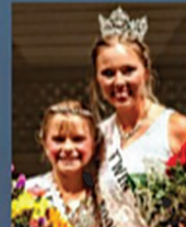
Queen Pageant Tuesday