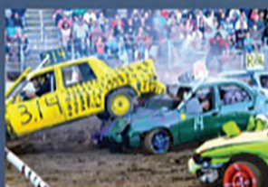
Demolition Derbies Sunday