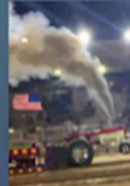
Truck & Tractor Pulls Thursday