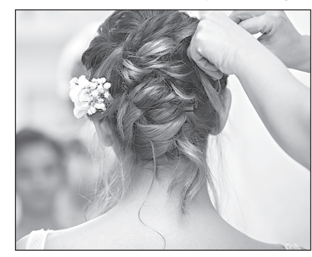
Maintaining and distributing a schedule of the day's events, including hair appointments, can help engaged couples keep their wedding day timeline on track.

• Go over schedules with your vendors. In the weeks prior to your wedding, reach out to your vendors to confirm the day's timeline. Do this prior to handing out a schedule to your bridal party so no one is confused if any last-minute changes