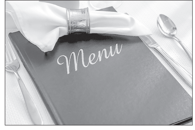
Picking a reception menu is a fun and filling component of wedding planning. Keeping some simple pointers in mind can help couples pick a menu everyone can enjoy.

Resist the urge to make the menu reflect your personal preference. Couples, particularly those footing the bill for their own weddings, may be tempted to pick exclusively foods they like for the reception. Though it's important that couples get to enjoy their first meal together after tying the knot, it's good to ensure that guests get to have an enjoyable meal as well. Resist any urge to let personal preferences dictate the menu, particularly if you have a restrictive diet. For example, vegans need not insist everyone eat a vegan meal at the reception nor should meat lovers insist that every plate end up with some red meat on it. Diversify the