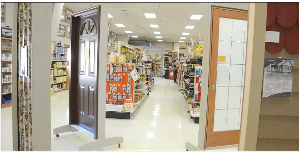
Come visit the showroom at Maze Lumber in Peru for the best building materials in the Illinois Valley.

For over 177 years, Maze Lumber has been providing the best building materials available to the Illinois Valley. Since the first shipment of lumber was sent down the Illinois & Michigan Canal to a growing Illinois Valley, Maze Lumber has been serving customers with high-quality building products to meet every need. Whether you're looking for kitchens or fireplaces, siding or Marvin windows and doors, decks or stone veneers, hardwood flooring or tile, Maze Lumber has exactly what you're looking for. The modern Maze Lumber Yard is housed in a 15,000-square-foot office and display building. Maze Lumber's "Hall of Flame" boasts the area's largest selection of gas and wood-burning fireplace displays in Central Illinois, featuring units from Lopi, Kozy Heat, Fireplace Extraordinaire, Osburn, and White Mountain Hearth. Maze offers a wide variety of do-it-yourself materials such as plywood, dimensional lumber, molding and millwork, hardwoods, and has the ability to special order nearly anything. Maze Lumber also carries a full line of major-brand plumbing products, including The Onyx Collection, Kohler, Moen, Delta, Cultured Marble of Arthur, Aker, Maax, and Sterling. Alongside Maze Lumber's extensive line of bathroom fixtures, you'll find Woodharbor, Breeze, and Bertch cabinetry, as well as a broad range of countertop options, including Cambria, Zodiaq, Silestone, Laminare, Corian, and natural stone. For your window and door needs, Maze is a world-