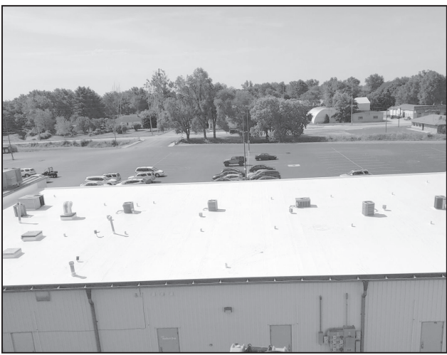
Here is a good example of overcoming complex roofing situations using Duro-Last's prefabricated accessories. Where most others fail, Northern Illinois Seamless Roofing can prevail.

ences from previous clients or a portfolio of completed projects. Contacting past customers can offer valuable insight into the contractor's reliability, workmanship and communication.