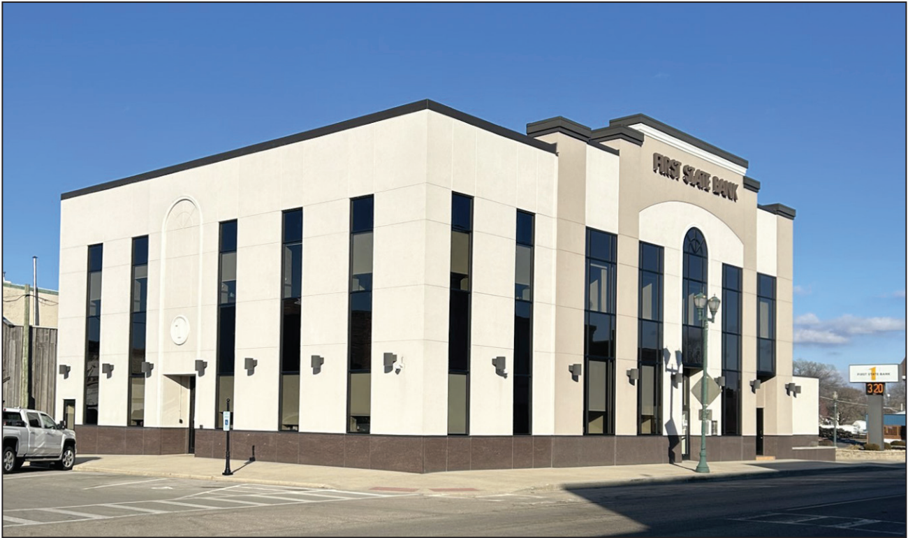
First State Bank has three locations in Mendota. The main bank, above, is located at 706 Washington St. The drive-up ATM, below, is at 800 Illinois Ave. First State Bank Plaza North is located at 1403 13th Ave.