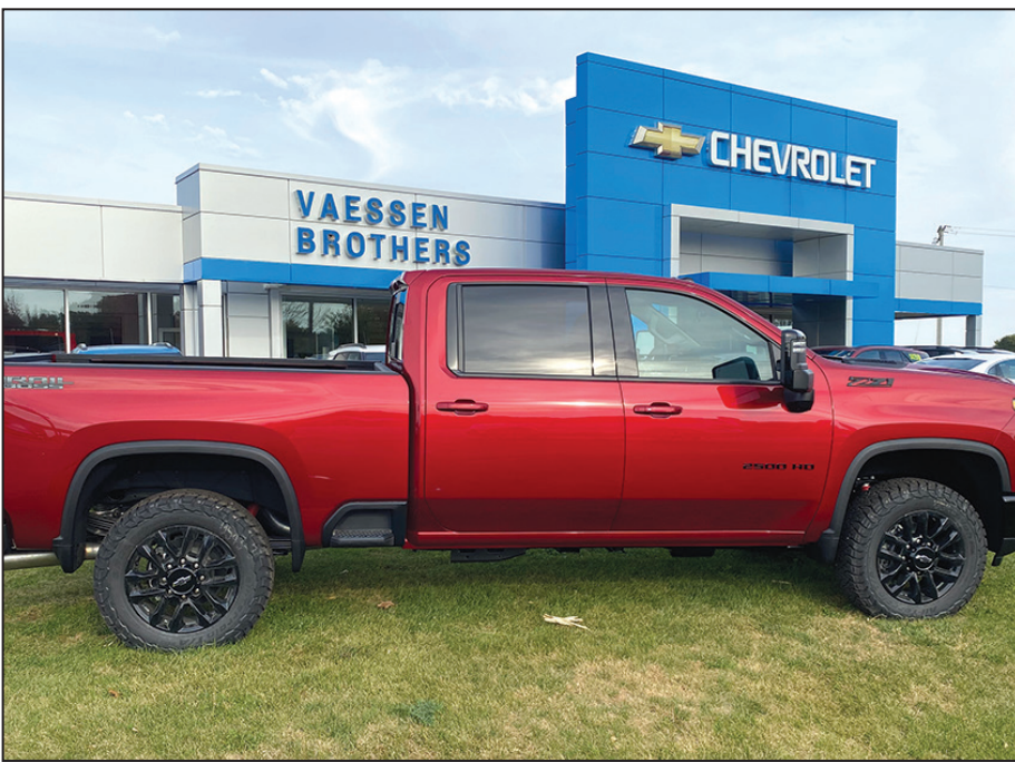
Vaessen Brothers Chevrolet in Sublette is a family-owned and operated business providing the best in the area service department, a great parts department and a wide selection of new Chevrolets and used vehicles.