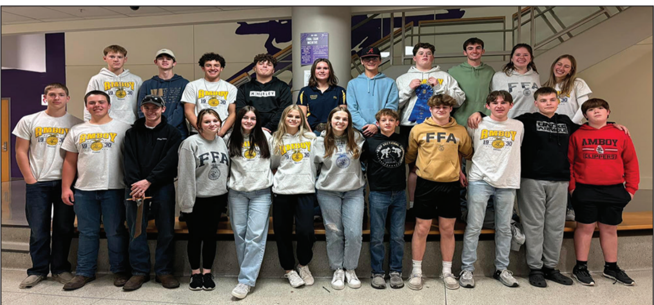
The Amboy High School FFA was successful during competitive events on Wednesday, Nov. 13.