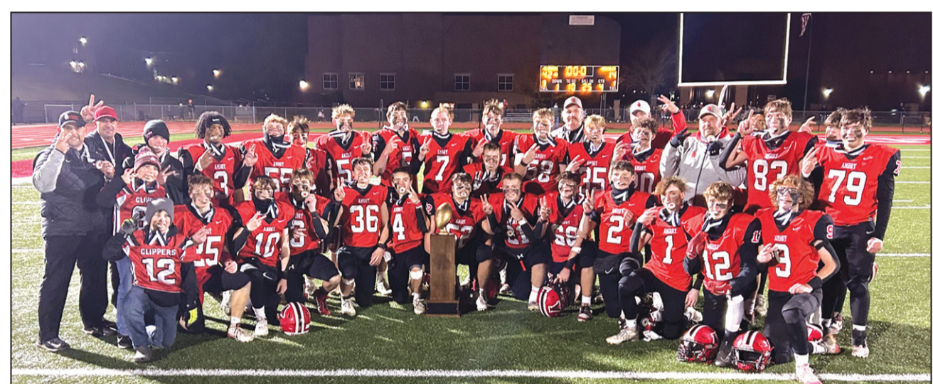
Top photo, members of the Amboy-LaMoille-Ohio football team reach for the trophy after defeating Milledgeville 41-14 in the Illinois 8-Man Football Association State Championship Friday, Nov. 22 at Monmouth College in Monmouth. Bottom photo, the Clippers put up two fingers to signify back-to-back championships. In a dynasty-like fashion, the team has been to the last three championships and has brought home the biggest trophy in 2023 and 2024. The only other football state trophy in the Amboy case is from 1984.