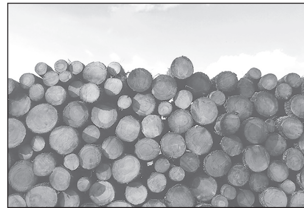
Pests are attracted to certain conditions, and remedying these issues can help reduce pest infestations.

• Clutter: Clutter provides hiding places for all sorts of rodents and insects, which can hide out in cluttered areas and remain comfortable. Going room to room and clearing out extraneous items may help reduce pest populations. Focus on the garage and basement, in particular.