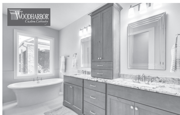
Check Out Our Luxury Bathroom Fixtures & Hardware

Bathroom renovations can be costly. Remembering some simple dos and don'ts can give homeowners the peace of mind that their renovation investment will result in an impressive, durable space.