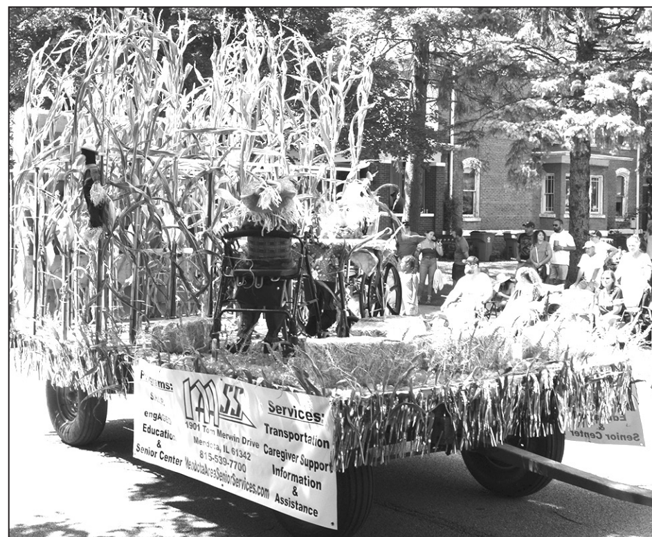
The Mendota Area Senior Services entry took second place for Best Use of Corn in the Grand Parade.