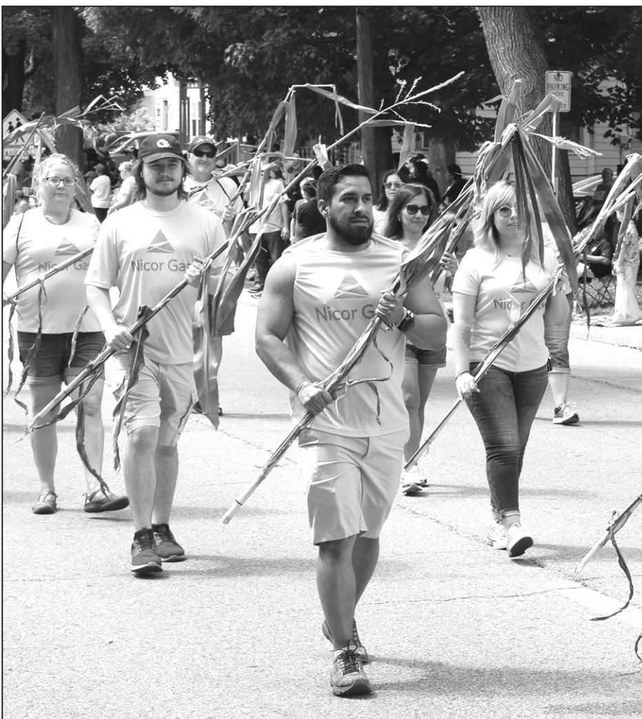
Nicor Gas and its "Nicorn" Drill Team received the first-place award in the Performance category during the Grand Parade.