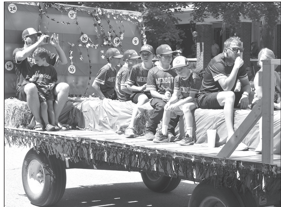
The Mendota Little League 10u All-Stars were honored with a ride in the Grand Parade after finishing in second place in the Illinois State Tournament held in Paris, Ill., in July. The team won 11 straight games during its tournament run before falling in the state championship game.