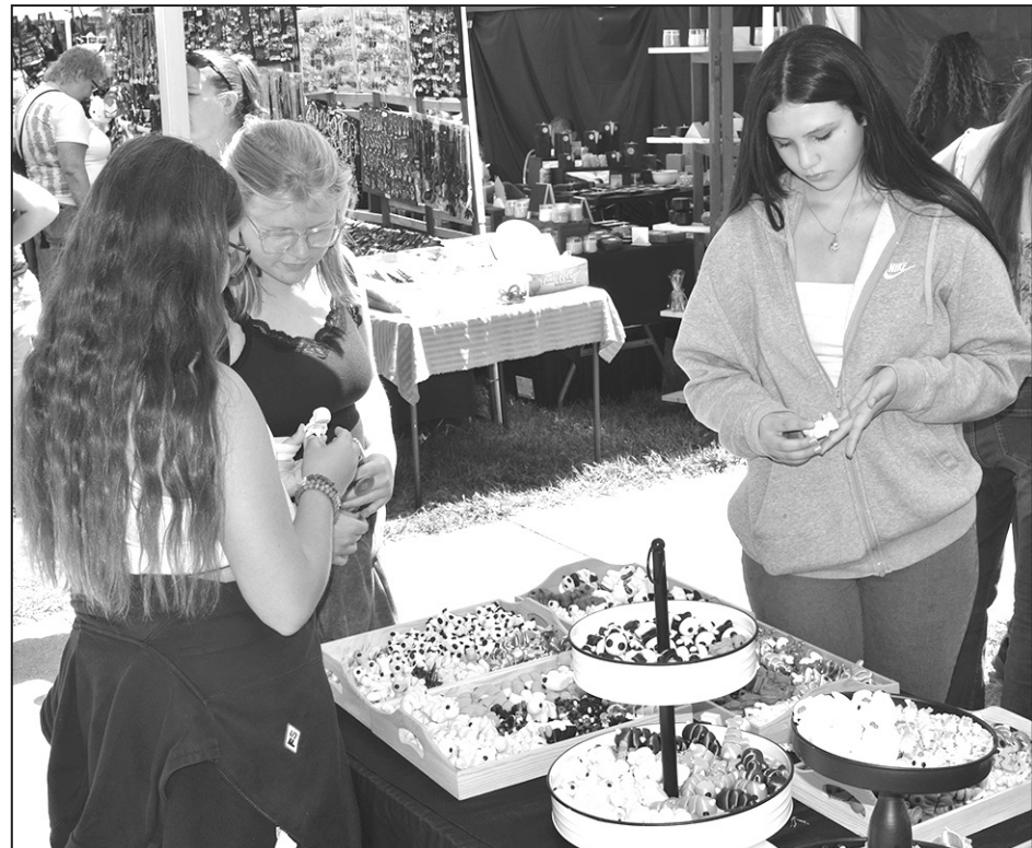
The Crafters Market Place & Flea Market drew large crowds at two locations on Saturday and Sunday of the festival.