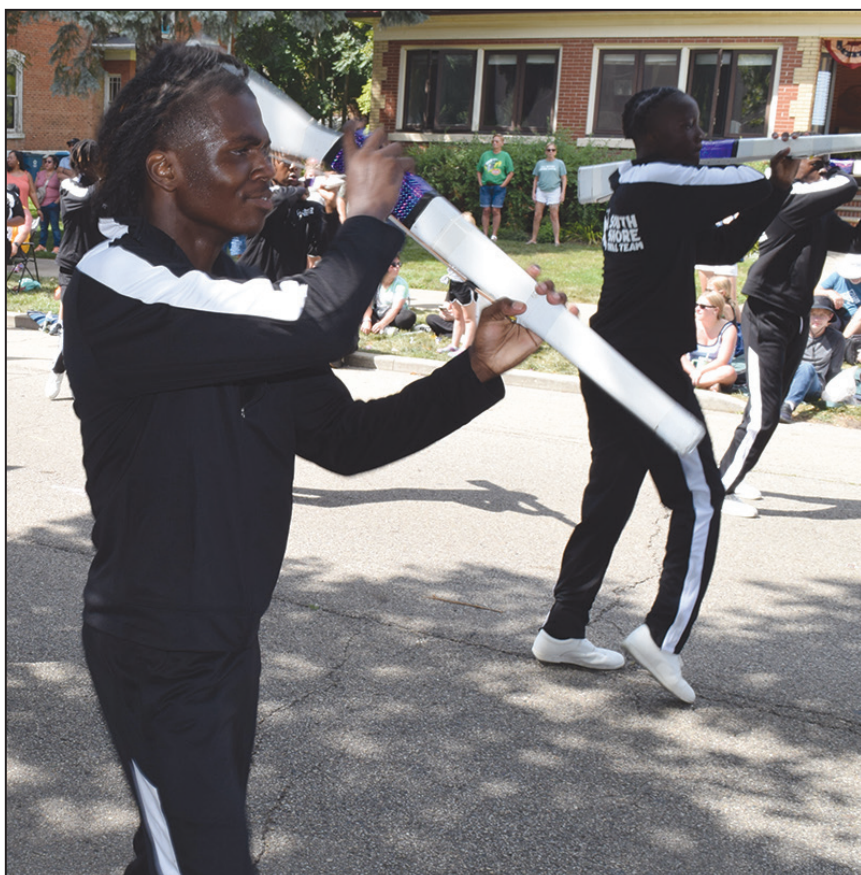
The South Shore Drill Team from Chicago delighted the parade crowd with performances throughout the parade route and in front of the Mendota Elks Lodge after the parade.