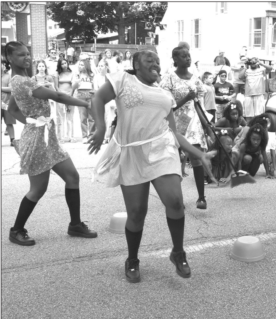
The Final Phaze Performance Dance Team of Chicago, which has been featured in dance videos, in movies, on B.E.T. and MTV, put on a spectacular show for the people lining the streets during the Grand Parade.