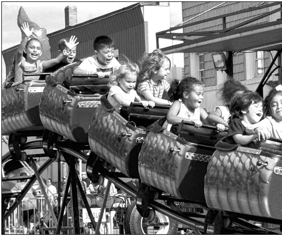
Some children were thrilled and others terrified during this trip on the Dragon ride located on the Carnival Midway.