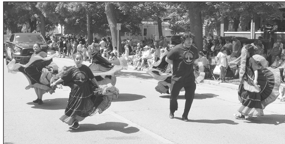
Mendota's very own De Colores Dance Group strutted their stuff throughout the route of the Grand Parade.

P.O. Box 620, Mendota, IL 61342 Phone (815) 539-6507 • www.mendotachamber.com