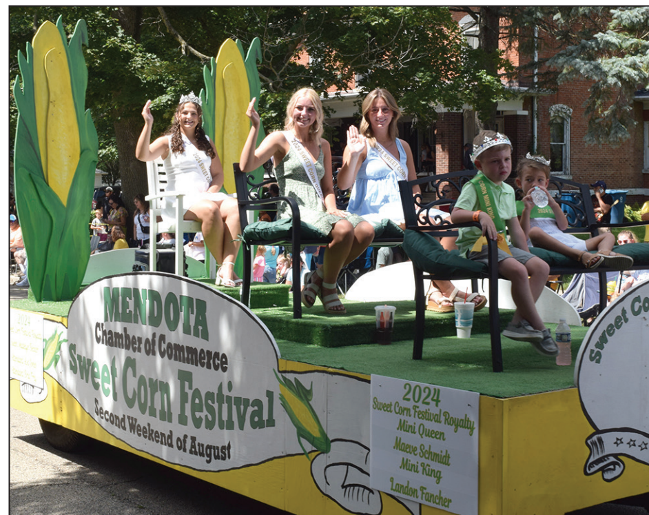
The Queen and her Attendants along with the Mini Royalty rode together on the Mendota Area Chamber of Commerce float during the Grand Parade.