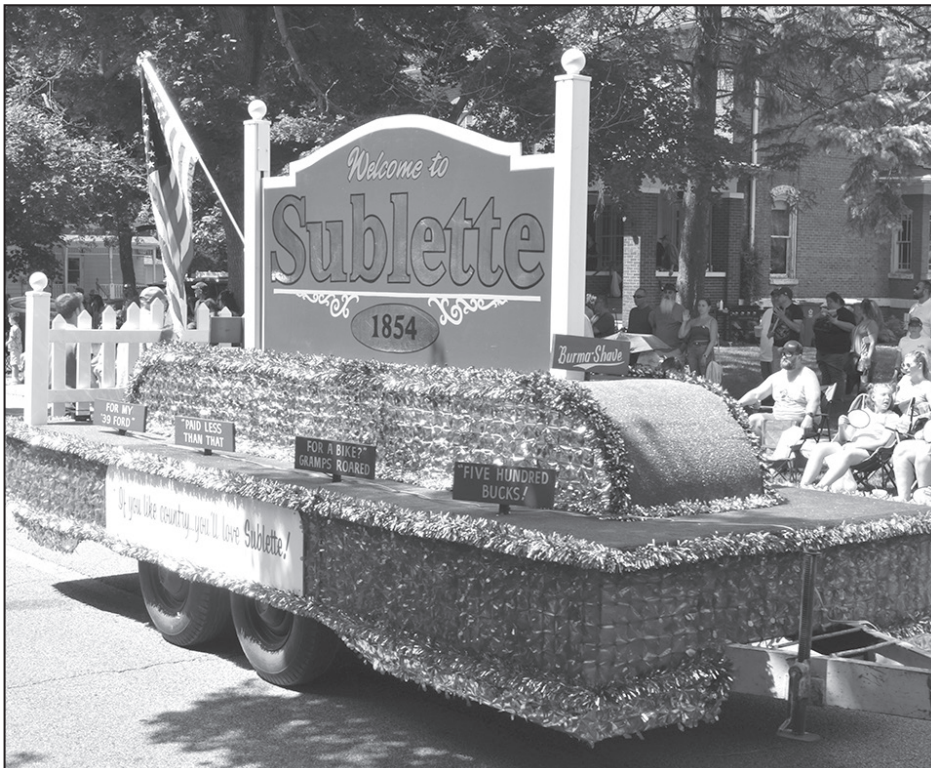
The Village of Sublette entry in the Grand Parade was chosen to receive the Friendship Trophy.