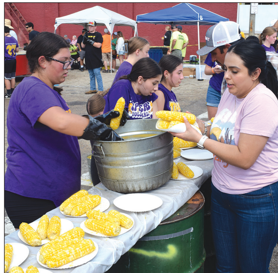
People stood in line down the 700 block of Illinois Avenue to get their hands on the delicious sweet corn served free at the corner of Illinois Avenue and Jefferson Street on Sunday afternoon.