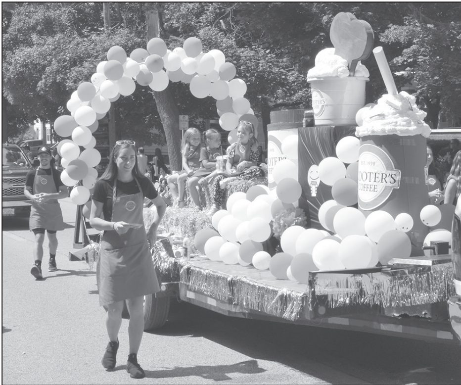
Scooter's Coffee of Mendota was chosen to receive the Queen's Trophy during Sunday's parade.