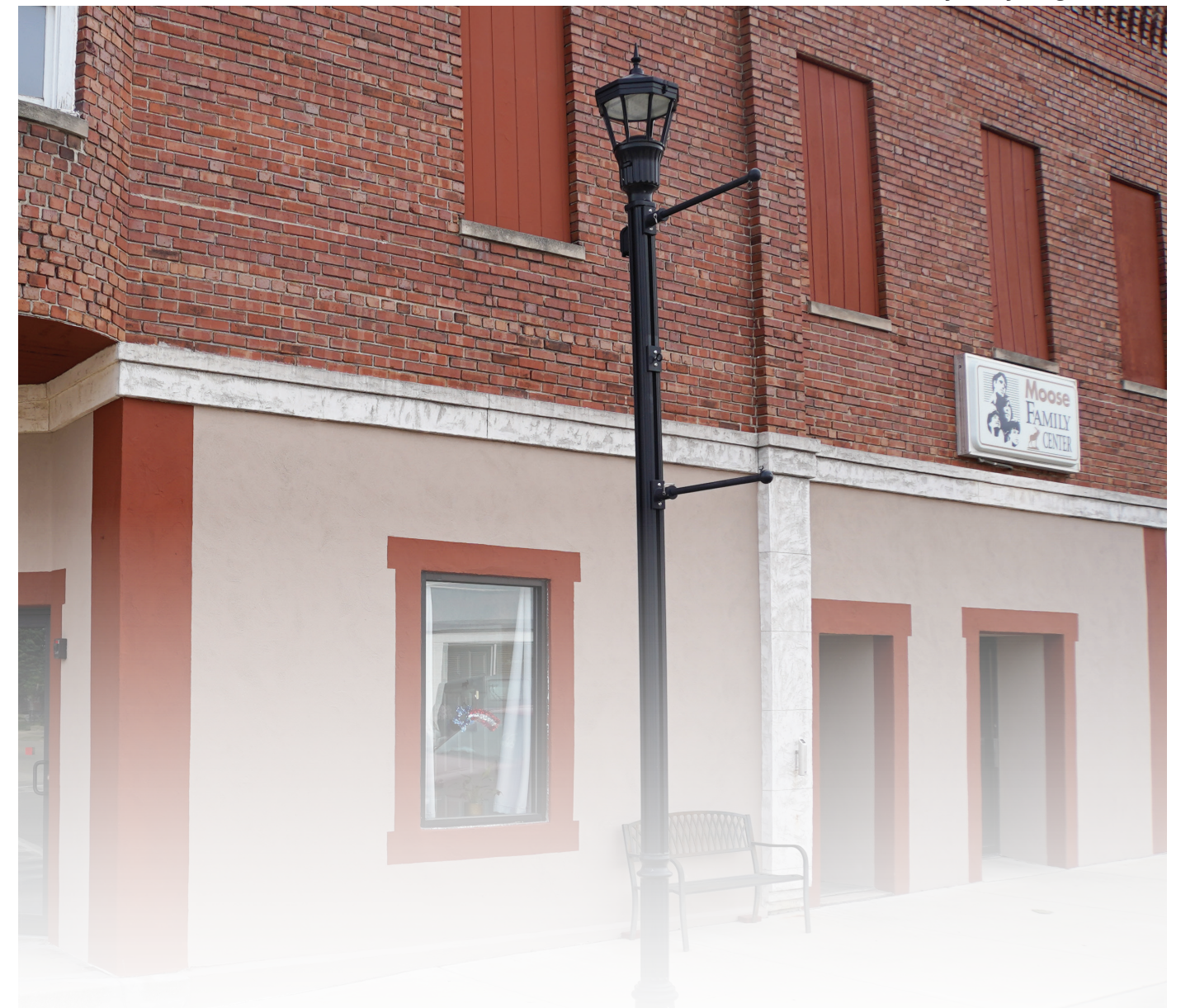
2023-24 Community Unity Magazine · 31