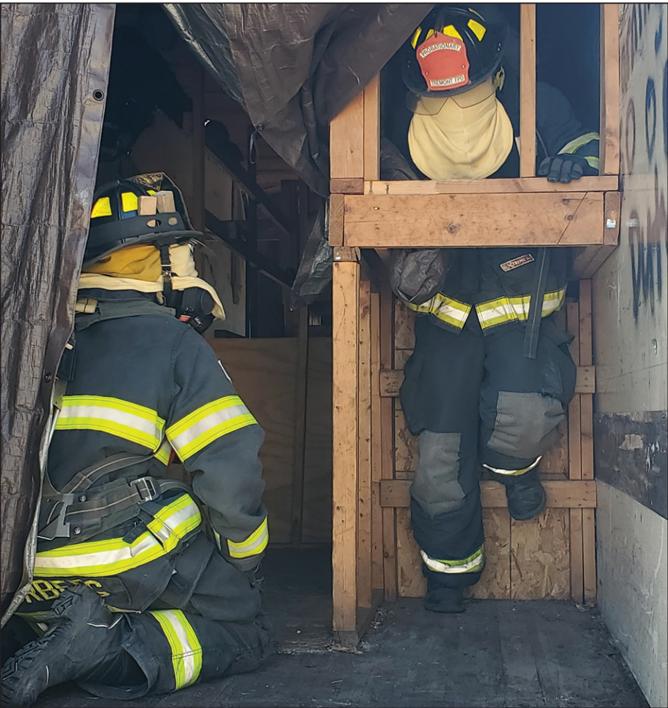
The Amboy Fire District offers free training to its members. Different training sessions are held at the Amboy fire station and the training grounds across the street.