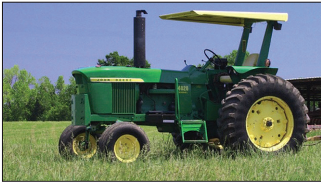
The featured tractor during the 42 nd Annual Sublette Antique Tractor & Toy Show from 9 a.m.-3 p.m. Saturday, March 16 and Sunday, March 17 is John Deere. Although all old and new John Deere tractors and equipment are welcomed, the John Deere 4020, left, is specially featured since 2024 is the 60 th year of the tractor.