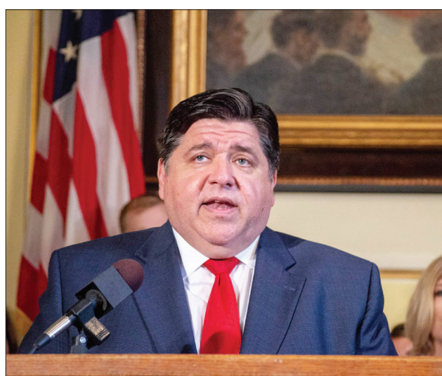
Gov. J.B. Pritzker speaks during a ceremony Aug. 22 in his Springfield office during which he signed a bill to raise the minimum wage for public school teachers in Illinois to $40,000 by 2023. Pritzker on Monday said he would sign a letter of consent to allow refugees to resettle in Illinois. The letter is required by the Trump administration.

“It’s not just the Chicagoland area, in which most people think refugees are going,” she said “It’s places like Aurora and DuPage and Moline, which is where Global Relief has offices. But it’s important for people to understand that there’s a variety of communities and Illinois that have supported refugee resettlement for over a decade.”