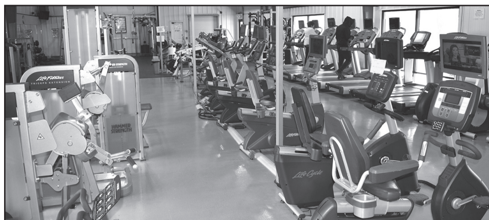
The Mendota Area YMCA has a wide range of exercise equipment and many other programs and services for its members.