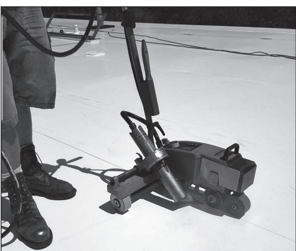
A Northern Illinois Seamless Roofing worker runs a self-driven hot air welder to weld the seams of a Duro-Last roof, creating one monolithic piece of roofing membrane.