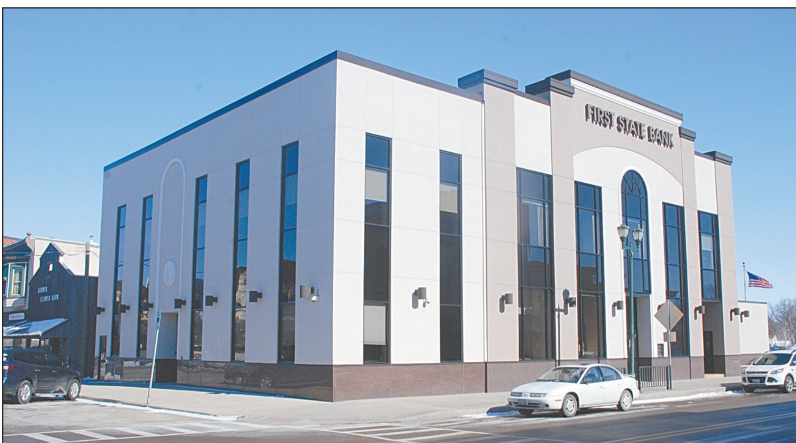
First State Bank's main facility is located on Washington Street in downtown Mendota.

A refreshed FSB website, featuring easier customer navigation, was also released alongside the new logo. As we head into the next decade, First State Bank is committed to remain at the forefront of the technology necessary to be competitive in the financial industry, while maintaining our community banking roots.