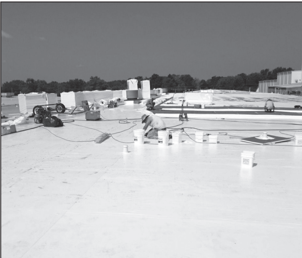
Northern Illinois Seamless Roofing workers install the Duro-Last roofing system on buildings at HCC, Inc., top, and Sullivan's Foods in Mendota, right.