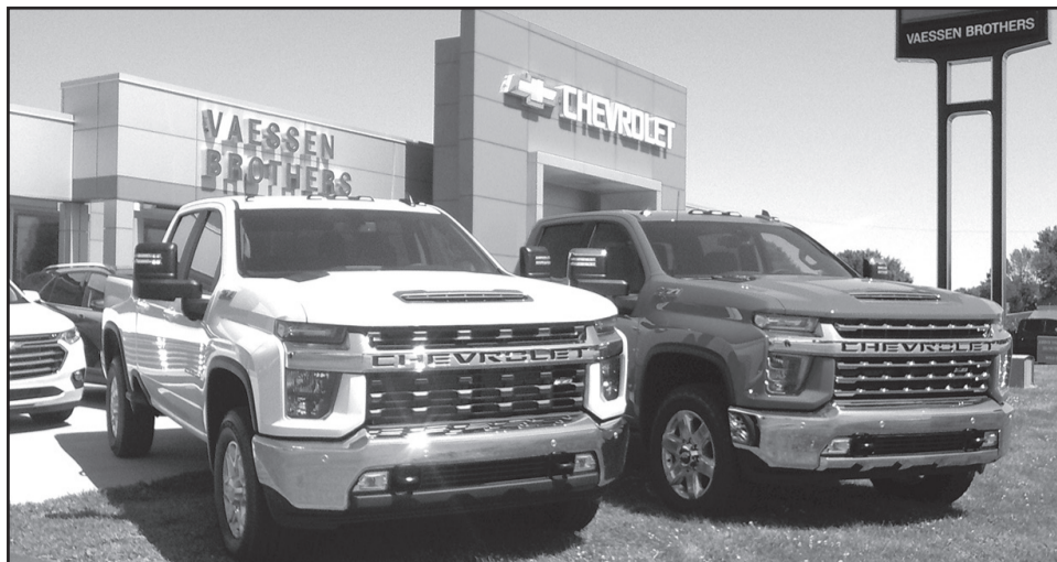
Vaessen Bros. Chevrolet in Sublette has been satisfying the needs of car and truck buyers since 1926.

"Hope to see you in our 73 rd year of customer satisfaction."