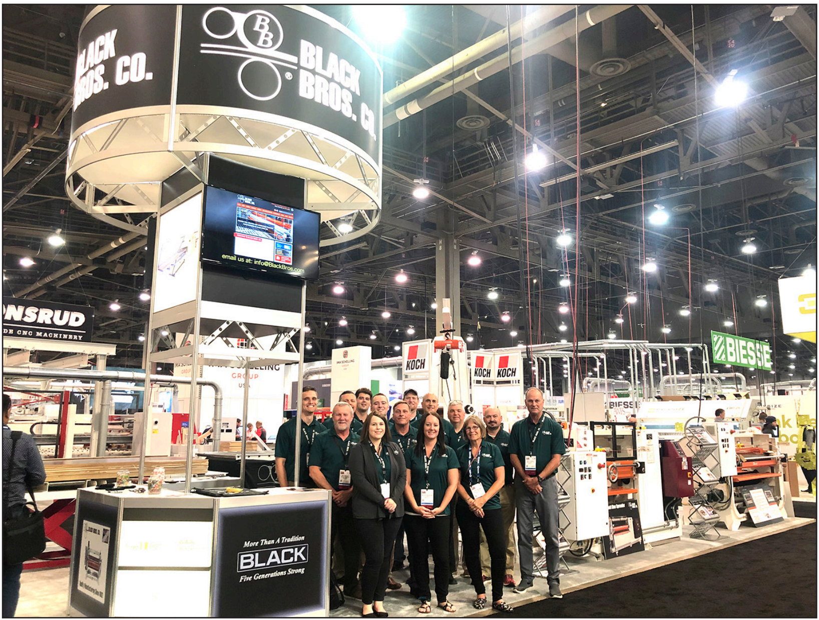
Black Bros. sales team exhibited at the AWFS Fair in July. The fair is a semi-annual tradeshow in Las Vegas for American woodworking and furnishing suppliers. Black Bros. had equipment on display and live demonstrations during the fair.

The people at Black Bros. are not only committed to producing quality machines, but also to the city of Mendota. Black Bros. employees can be found volunteering for many area organizations,