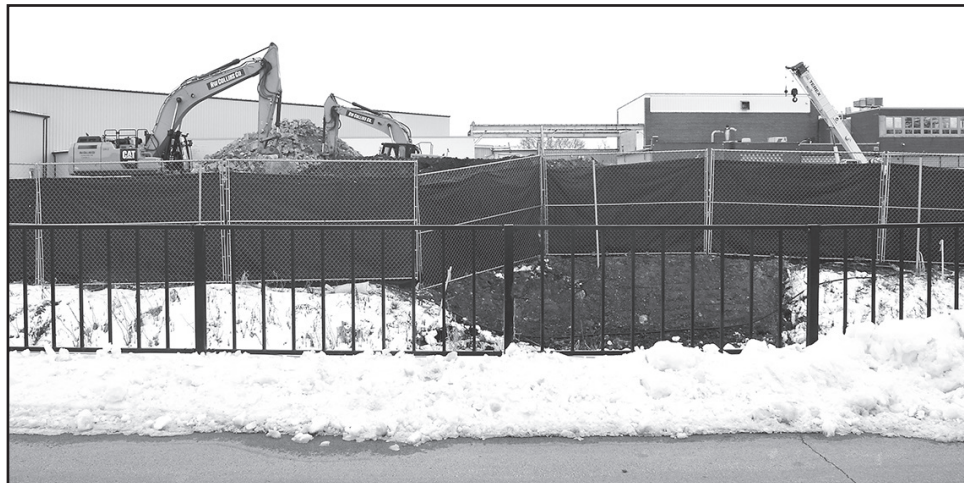
Clean-up has begun at the site of an old manufactured gas plant on the Black Bros. Co. property in Mendota.