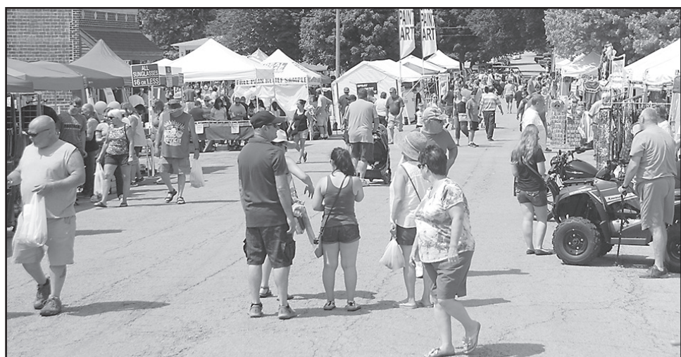
Festival-goers stroll through the Midway at the Sweet Corn Festival in downtown Mendota. A wide variety of activities helped attract large crowds to the four-day event. The 73rd Annual Sweet Corn Festival will be held Aug. 6-9.