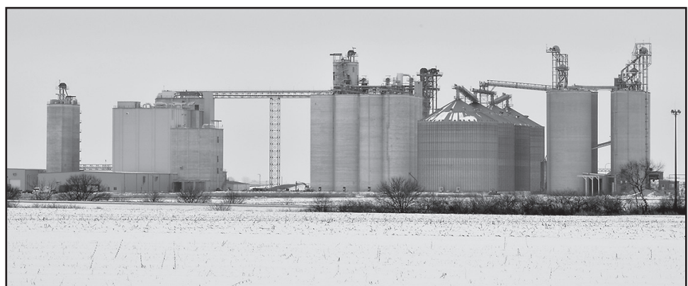
The ADM flour mill facility dominates the skyline on the east side of I-39.

The city improved its look in 2019 and made way for possible redevelopment of property with the demolition of unsightly and abandoned buildings, and the clean-up process will likely continue in 2020.