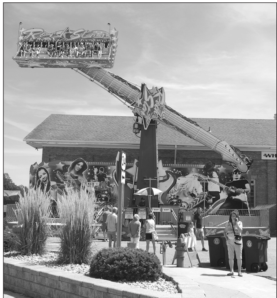
Brave people on the Rock Star ride get a thrill as they soar way into the sky.