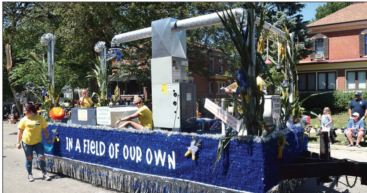
The Walter Bros. Plumbing & Heating float was the winner of the Queen's Choice award.