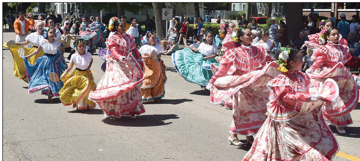
Local dance group Ballet Folklorico performs during the Grand Parade.