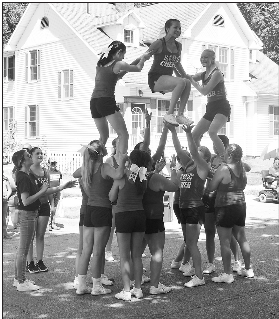
The Mendota High School cheerleaders perform a routine during the Grand Parade.