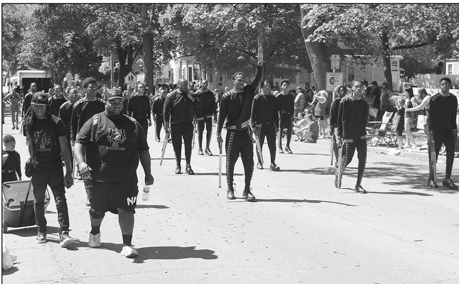
The Chicago Golden Knights Drill Team revs up the crowd during the Grand Parade.