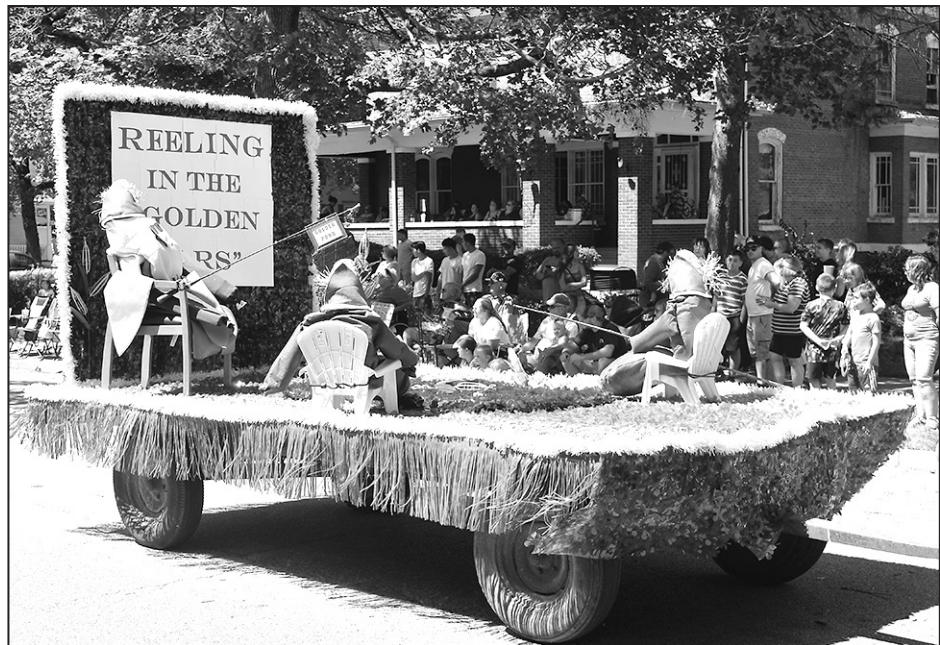
Mendota Area Senior Services float in the Grand Parade.