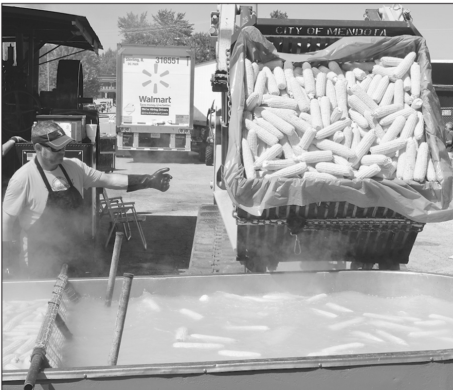
Gabe Wade stands watch as more sweet corn is loaded into the trough for cooking.