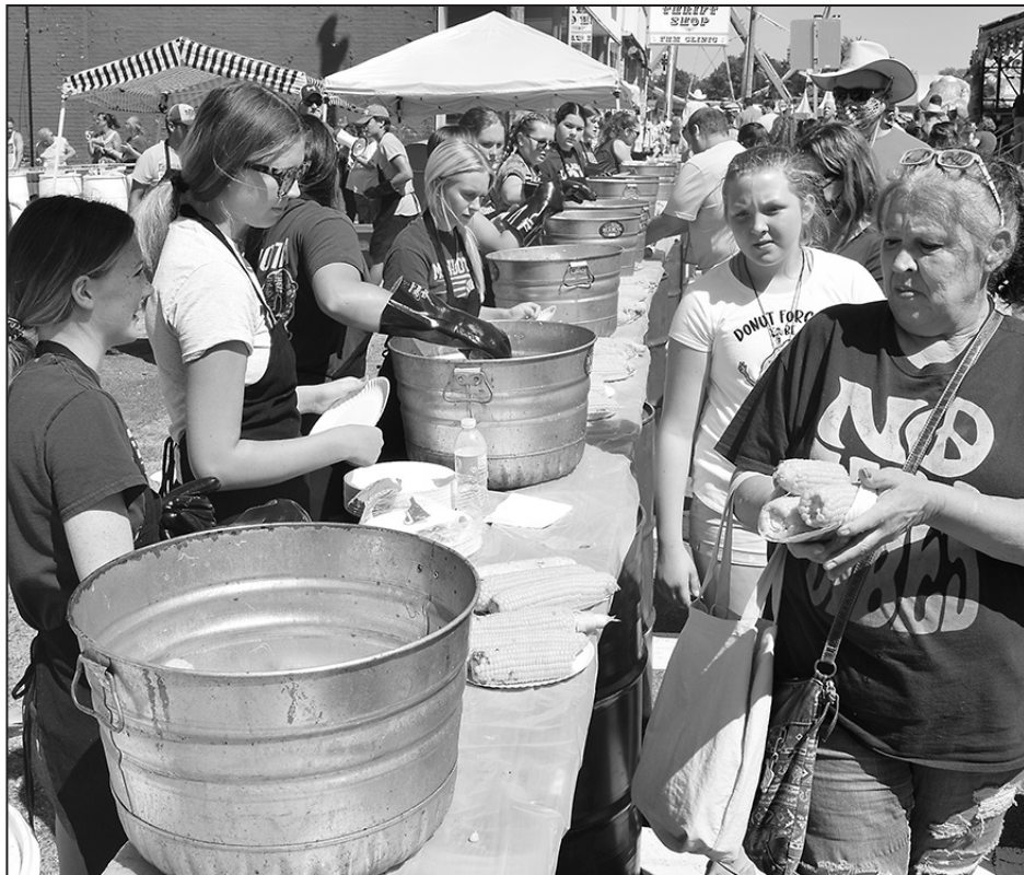
Festival-goers can't wait to sink their teeth into the delicious sweet corn.