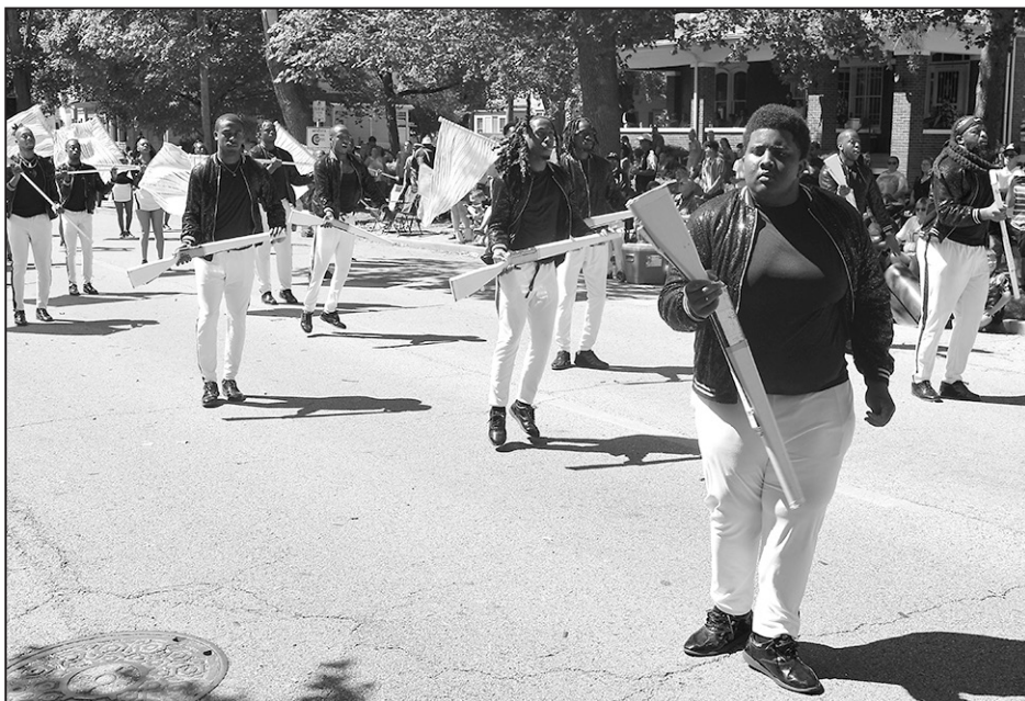
The Chicago South Shore Drill Team performs one of its electrifying routines during the Grand Parade.