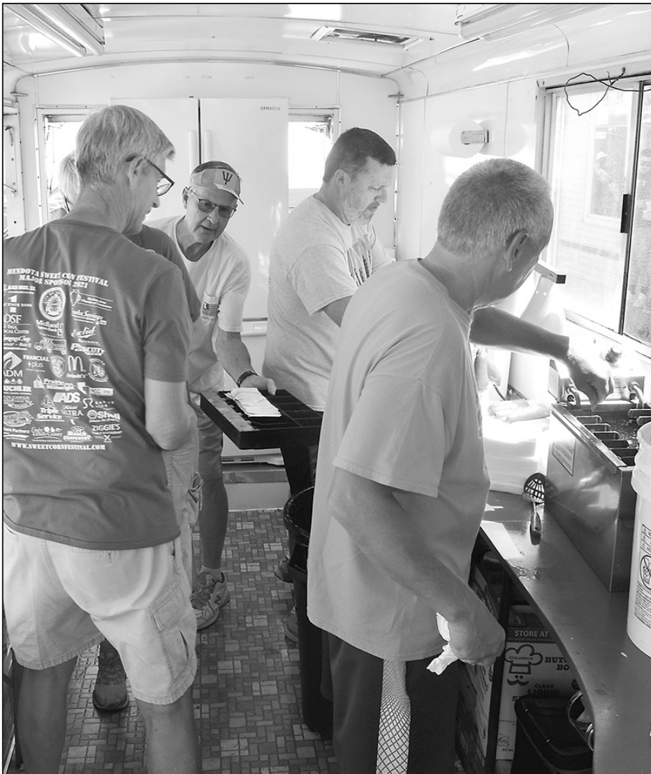
The Mendota Lions Club corn dog crew cooks up those scrumptious corn dogs, which have been a favorite of festival-goers for decades.