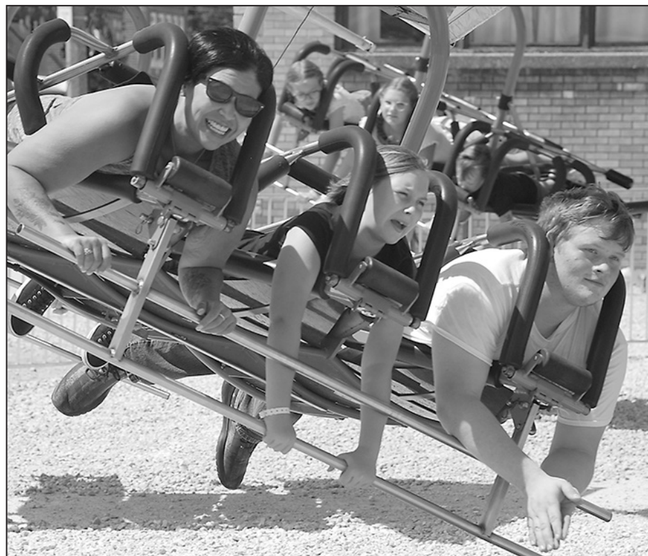
All kinds of emotions are being expressed during this ride at the festival.