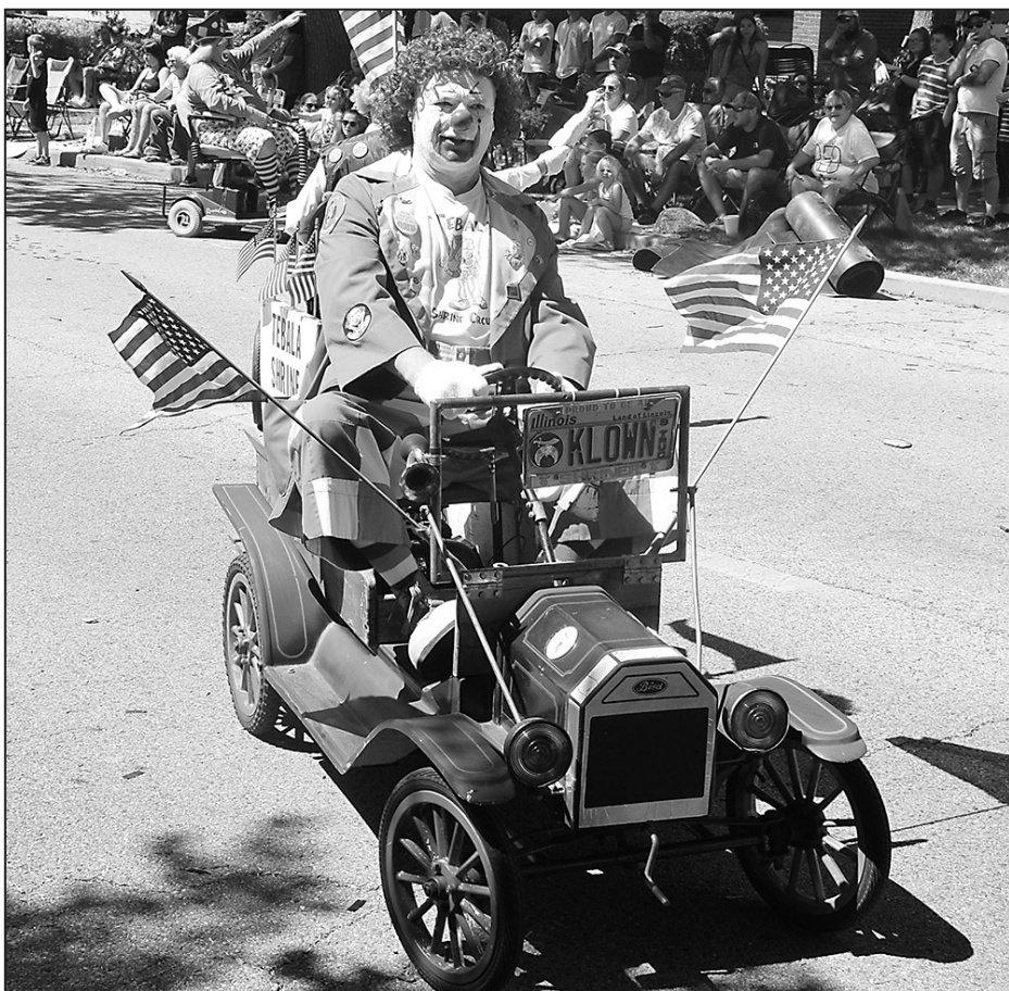
A Tebala Shrine Clown drives a miniature car during the Grand Parade.