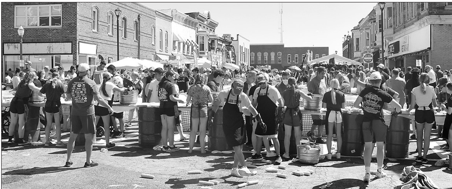
People line up on Illinois Avenue to get their free ears of delicious, hot-buttered sweet corn during Sunday of the Sweet Corn Festival.