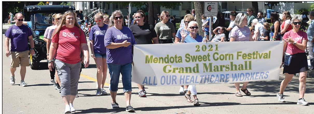
All healthcare workers were Grand Marshals of the Sweet Corn Festival Grand Parade on Sunday.