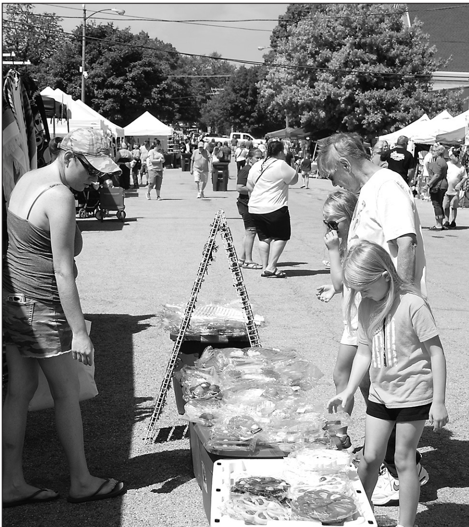
People check out the offerings at the Crafters Market Place & Flea Market.