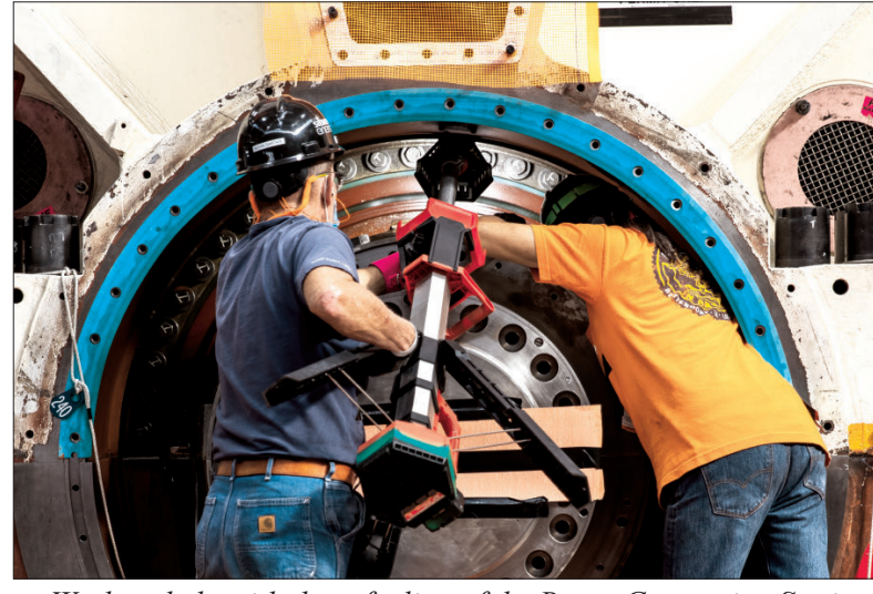
Workers help with the refueling of the Byron Generating Station.

es,” said Dave Rhoades, Exelon Generation’s Chief Nuclear Officer. “These plants are not only important for the clean energy they produce, but they are massive economic engines for their local communities, contributing more than $1.6 billion to Illinois’ GDP each year.” Byron Station began refueling Unit 1 after Gov. J.B. Pritzker signed the clean energy legislation. While the nuclear support provision represents less than 20 percent of the cost of the overall legislation in the coming years, it has an outsized impact on the state’s climate and economic goals. Saving the plants pre-