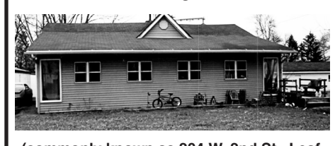
(commonly known as 204 W. 2nd St., Leaf River, IL 61047)