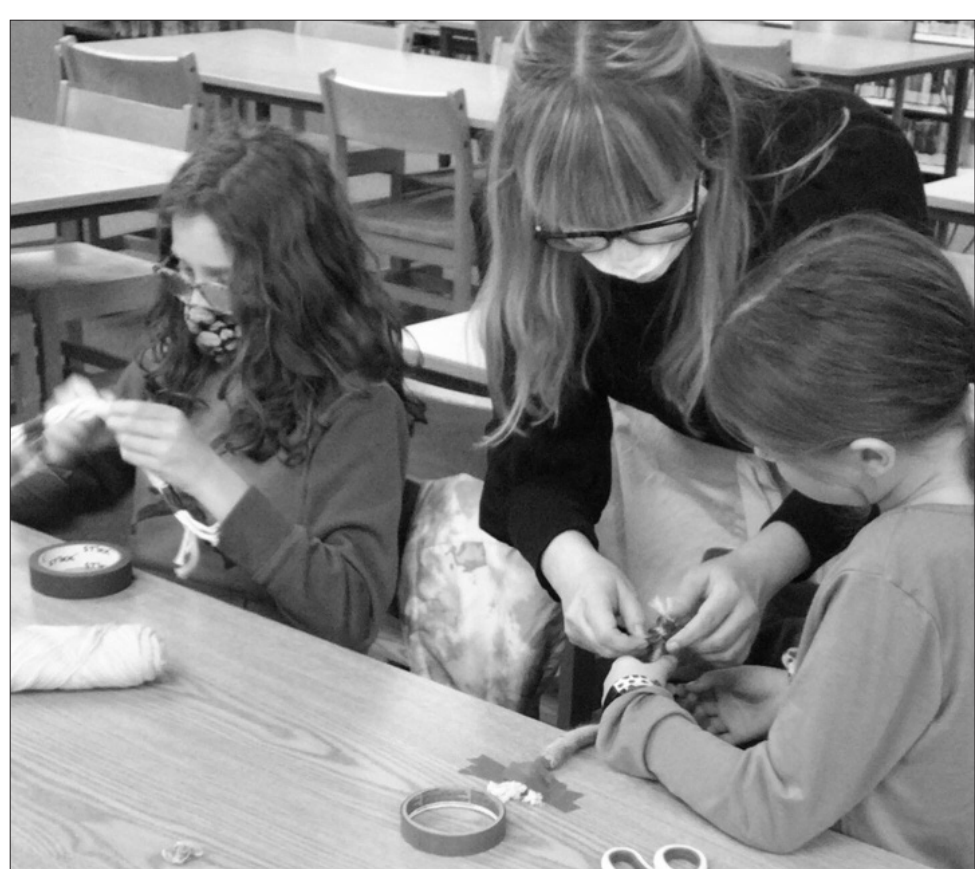
This March, Julia Hull Library tweens (ages 10-12) found a rainbow at the end of a rainy Spring-like day – using macrame cording and yarn to make a fun and colorful decoration! (Stillman Valley)