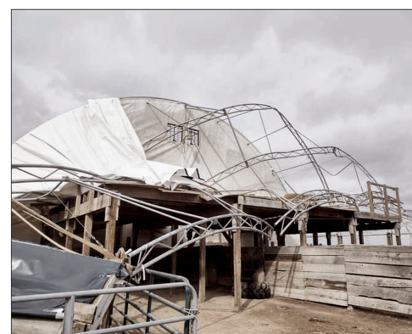
The main arena building used by Pegasus Special Riders was severely damaged by high winds on March 5.

Help from the community in the form of donations is already coming in too. Rochelle Kiwanis Golden K recently donated to Pegasus to help cover costs of the damage to the facility.