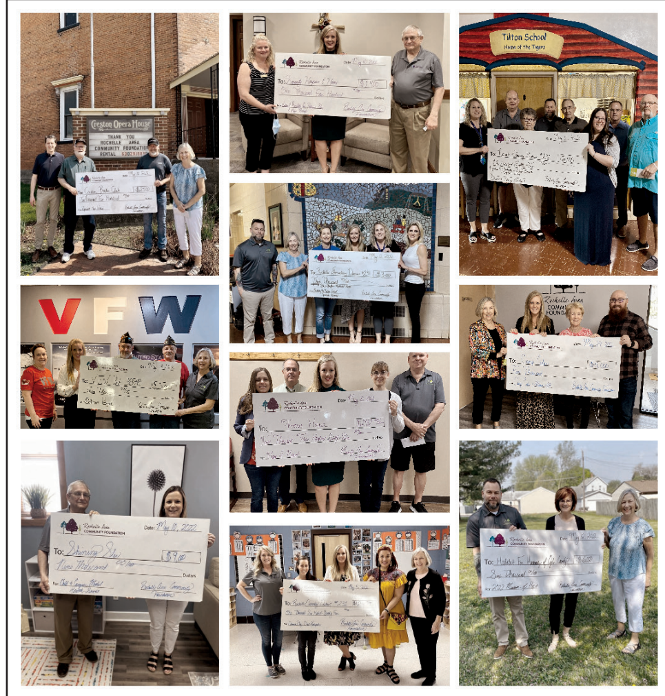
The Rochelle Area Community Foundation proudly announces the 2022 Community Needs Grant recipients totaling $85,000 in local support.