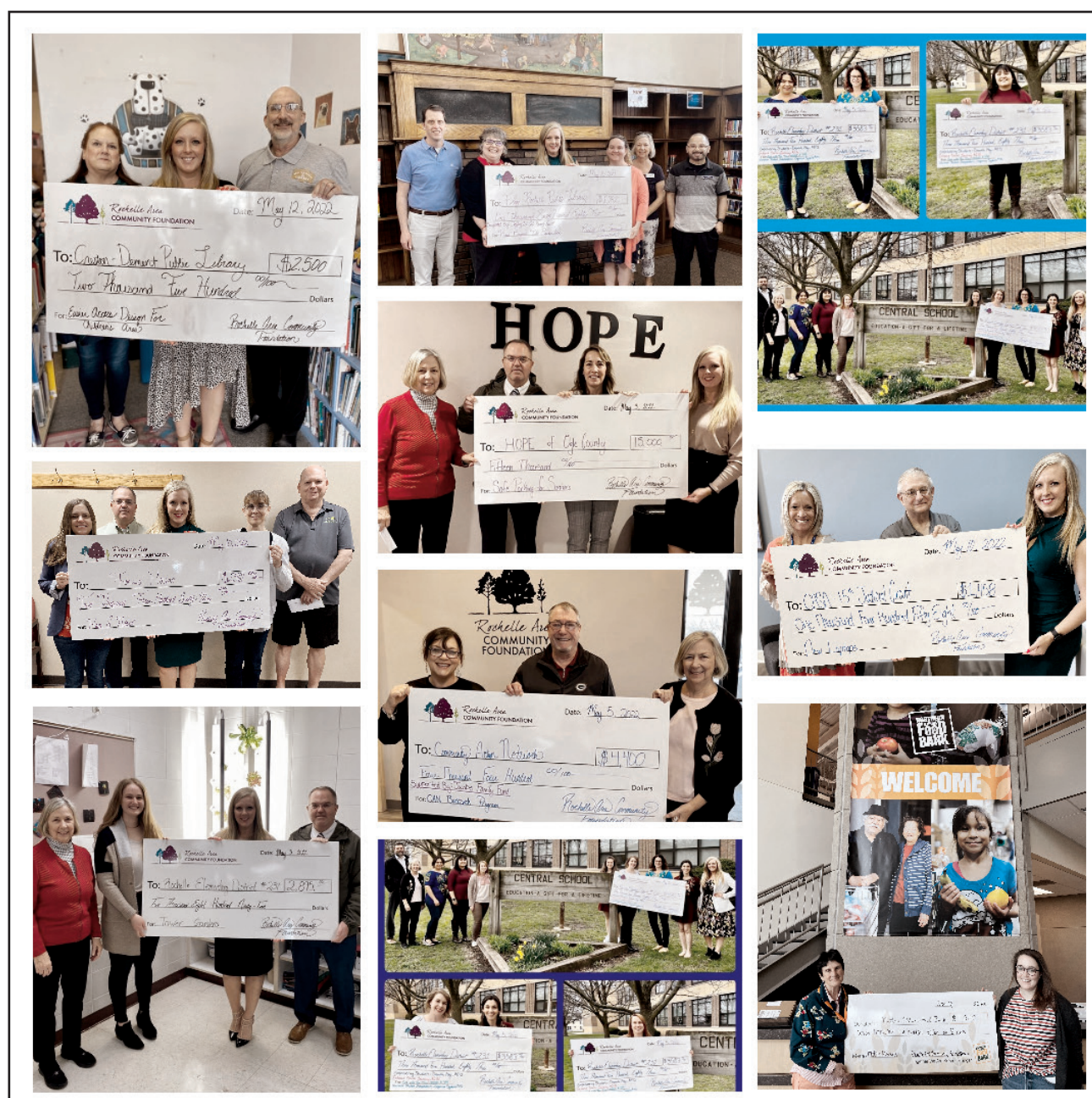
The RACF Community Needs Grants opens every year on Feb. 1 through March 1. RACF serves the communities of Chana, Creston, Esmond, Kings, Lindenwood, Rochelle and Steward.

Inspire Learning Fund of RACF Grant recipient: Rochelle Elementary School District #231 Project Classroom Library Overhaul- $185. Tom Hall Community Giving Fund in collaboration with the RACF