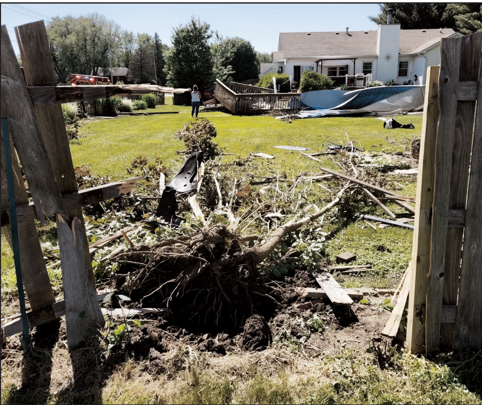
A Rochelle man was transported to Rochelle Community Hospital and treated for injuries after a Friday afternoon vehicle accident near South Mill Pond Road in Flagg Center, an Ogle County Sheriff's press release said.