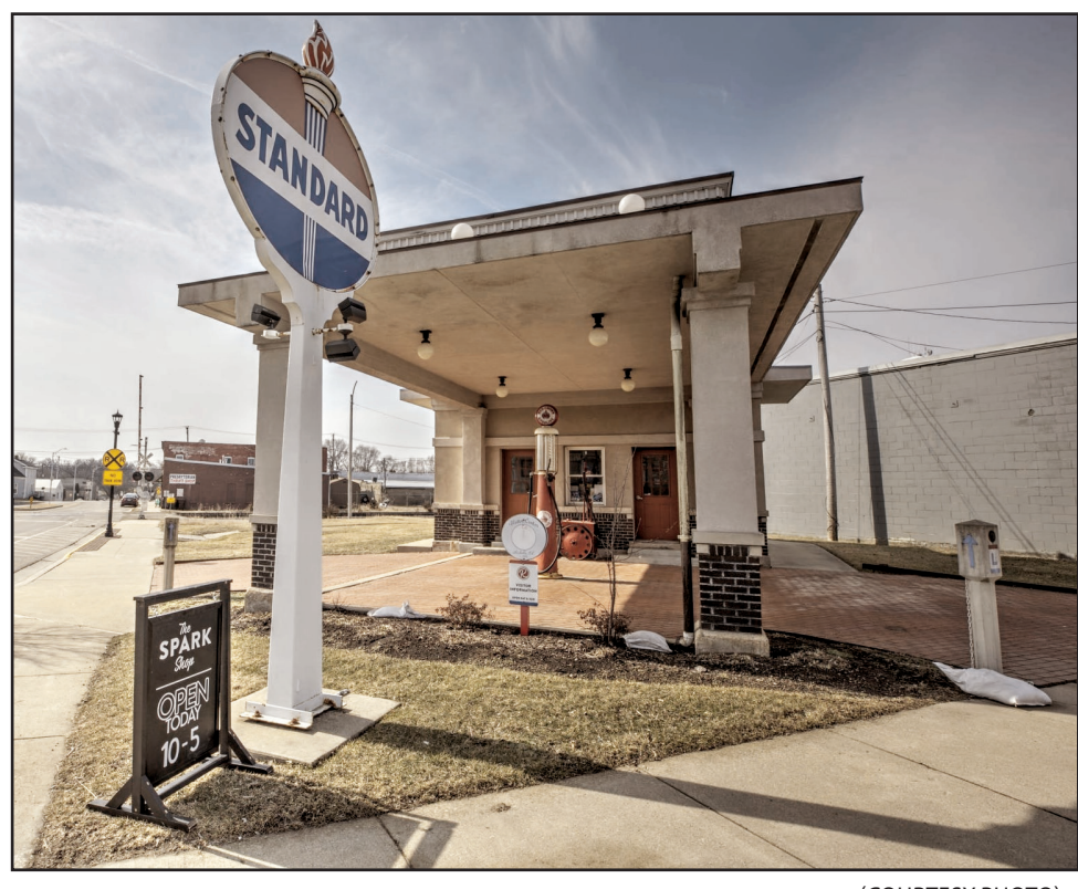
Since the Rochelle Chamber of Commerce, Rochelle Retail Advisory Board and the City of Rochelle opened The Spark Shop last October, things have been “going well” at the retail incubator for local small business owners.