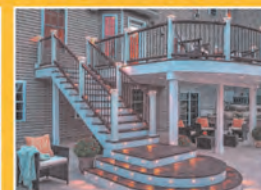
DECKING & FLOORING