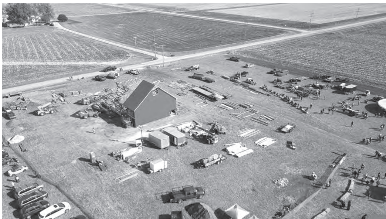
An aerial view shows the scope of the effort to relocate a nearly 150-year-old barn from a Douglas County farm to the Illinois Amish Heritage Center campus in the heart of Amish country, between Arcola and Arthur.

Firmatas staff also restored and replaced some of the