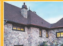
STONE, SIDING & ROOFING