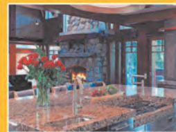
CABINETS & COUNTERTOPS