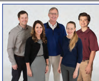
FARM – HOME – CROP – HAIL – AUTO – LIFE COMMERCIAL – BONDS – HEALTH

The Illinois Soybean Association (ISA) checkoff and membership programs represent more than 43,000 soybean farmers in Illinois. For more information visit the website www.ilsoy.org and www.ilsoygrowers.com .