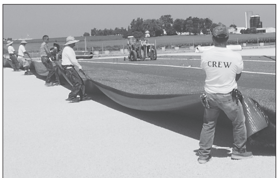
Mendota High School's new athletic stadium begins to "go green" on Friday, July 15, 2011, as workers from Extend Across the Field process laying artificial turf. The turf is laid in strips that extend across the field. Each strip is laid face down on top of the preceding one, the two are sewn together by machine on the underside and then unfolded. The 2023 Board of Education estimates that within the next five years, the track around the stadium will need resurfacing, and another estimate is for the turf replacement, and that should occur within the next seven to nine years.

In 2017, an energy audit of lights and fixtures were completed. Following the recommendations of the energy audit, the board replaced lights, fixtures, and new parking lot fixtures. The same year, there was significant work done on the installation of electricity to the baseball and softball fields, dugouts, and tennis courts. The Mendota High School Athletic Booster Club donated over $13,000 to make this project possible. After fiscal year 2020, there have been significant capital improvements. Gym lights were replaced for $32,916. It was also time for a new chiller and HVAC control panel system and an upgrade to the parking lot lights and outside building lights for a cost of $711,984. The back parking lot surface, front parking lot surface, a safer enclosed building connection was designed and constructed between the vocational and main building, metal roof shingles on the main building, new lights in the vocational building, and a complete renovation to modernize four science labs and classrooms were completed for $3,494,821. Another necessary capital improvement was the replacement of one 300-gallon water heater with four tankless heaters and replacement of five control valves for a cost of $53,023.