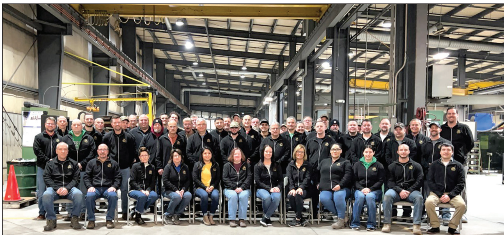
The Black Bros. Co. Team

Since that time Black Bros. Co. has remained profitable by staying true to its values: innovative engineering, impeccable manufacturing, and dedicated service. And, through the years the people of Black Bros. also have been committed to the Mendota community, including numerous past Chamber of Commerce presidents and volunteers across a multitude of civic and youth organizations. Manufacturers who use Black Bros. equipment include producers of furniture, kitchen cabinets, doors, windows, wall paneling, ceiling and floor tile, electronics, and automobiles to name a few.