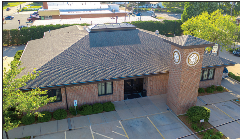
Eureka Savings Bank has five locations to serve its customers, including at 1300 13th Ave. in Mendota.