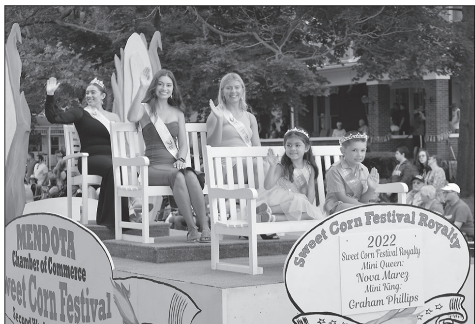
The 2022 royalty ride in the Grand Parade on Sunday of the Chamber-sponsored Sweet Corn Festival.

Other events sponsored by the Chamber include the Valentine Baby Contest, The Chamber Games, Sweet Corn Festival Golf Classic,