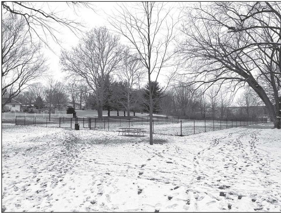
The city of Mendota made improvements to the Lake Mendota Park area in 2022, adding a dog park, above, and a pickle ball court, right.