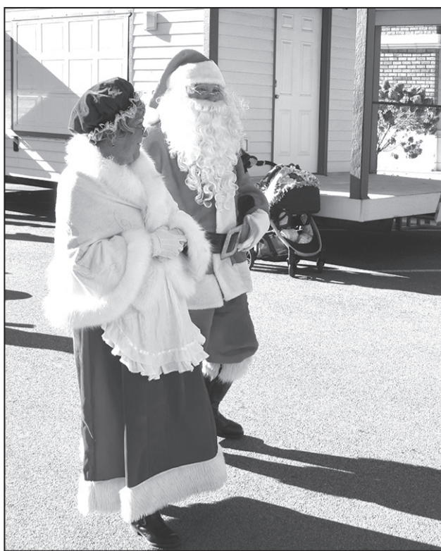
Santa and Mrs. Claus make their way down Illinois Avenue to Santa's House during "A Mendota Christmas" event in December, which is sponsored by the Chamber.

The Chamber once again sponsored the Shop Local program this holiday season. The program ran from Nov. 21 through Dec. 21. For every $10 spent in one of the over 60 participating businesses, customers received a sticker for their Shop Local card. Once cards were filled,