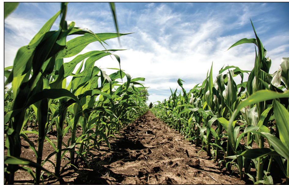
USDA's prospective plantings report released estimates that corn acres this spring could total 91.99 million acres, up 3.42 million acres or 4% from last year, and soybean acres could total 87.51 million acres, a slight increase from 87.5 million acres in 2022.

Estimates for total winter wheat acres, however, rose to 37.5 million acres, up 12.7% from 2022, and durum increased 9.1% to 1.78 million acres.