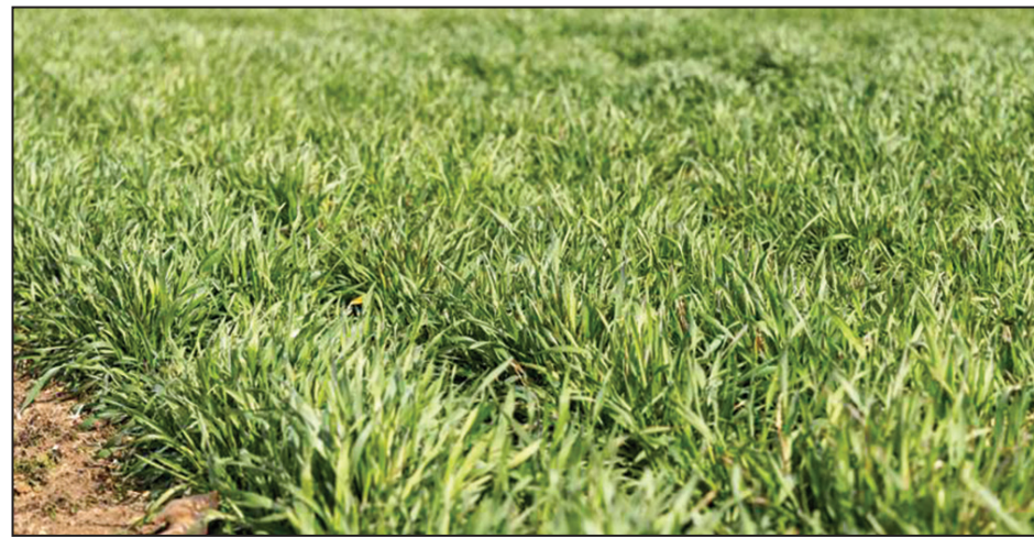
Growing wheat in Illinois this winter came with challenges, but this field in Mason County is looking good.

(This story was distributed through a cooperative project between Illinois Farm Bureau and the Illinois Press Association. For more food and farming news, visit FarmWeekNow.com .)