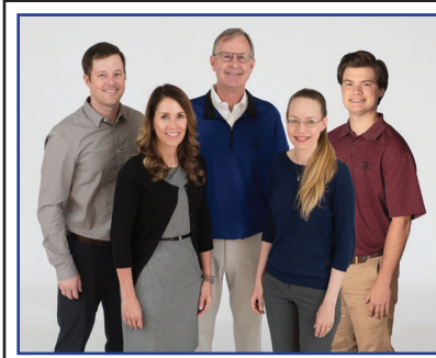
FARM – HOME – CROP – HAIL – AUTO – LIFE COMMERCIAL – BONDS – HEALTH

(This story was distributed through a cooperative project between Illinois Farm Bureau and the Illinois Press Association. For more food and farming news, visit FarmWeekNow.com .)