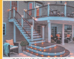
DECKING & FLOORING