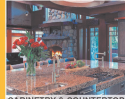
CABINETS & COUNTERTOPS