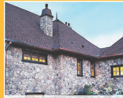
STONE, SIDING & ROOFING