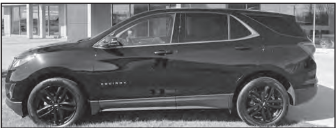
2020 Chevy Equinox LT FWD Midnight Edition, GM Certified, 1-owner, Local Trade, Leather, Heated Seats, Touchscreen Radio, Black & More!