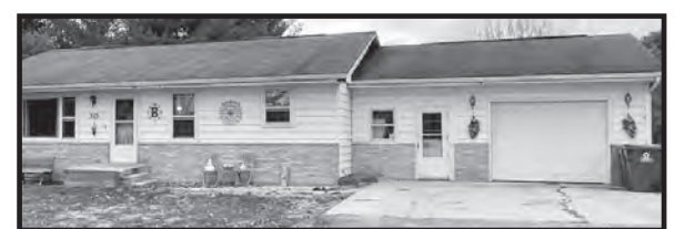
323 W Main St., Amboy $125,000

This ranch style home is ready for you to move into! Large back yard with concrete patio to entertain and relax by a fire. Features include 3 bedrooms, 1 bath, all appliances stay, central air and heat, family room in the basement and workshop area. Call today for a showing!