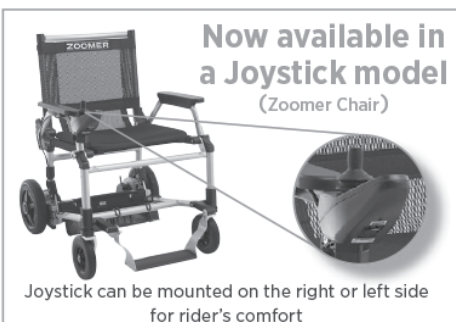
Now available in a Joystick model (Zoomer Chair)

Please mention code 601449 when ordering