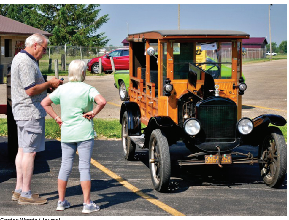
Gordon Woods / Journal