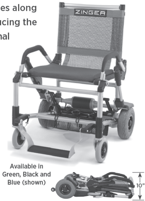
Available in Green, Black and Blue (shown)

The first thing you'll notice about the Zinger is its unique look. It doesn't look like a scooter. Its sleek, lightweight yet durable frame is made with aircraft grade aluminum so it weighs only 47.2 lbs. It features one-touch folding and unfolding - when folded it can be wheeled around like a suitcase and fits easily into a