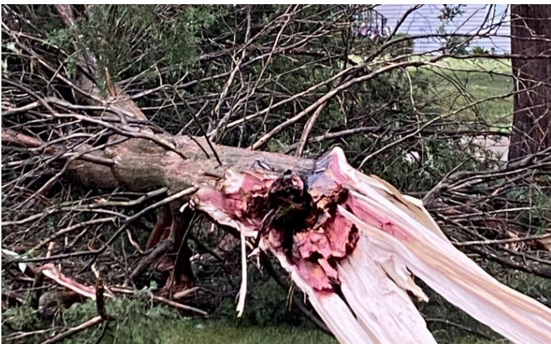
The storm brought down this cedar tree along S. Madison Street.