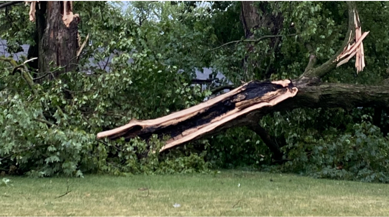
The June 29 storm split open this tree along E. Van Buren Street.