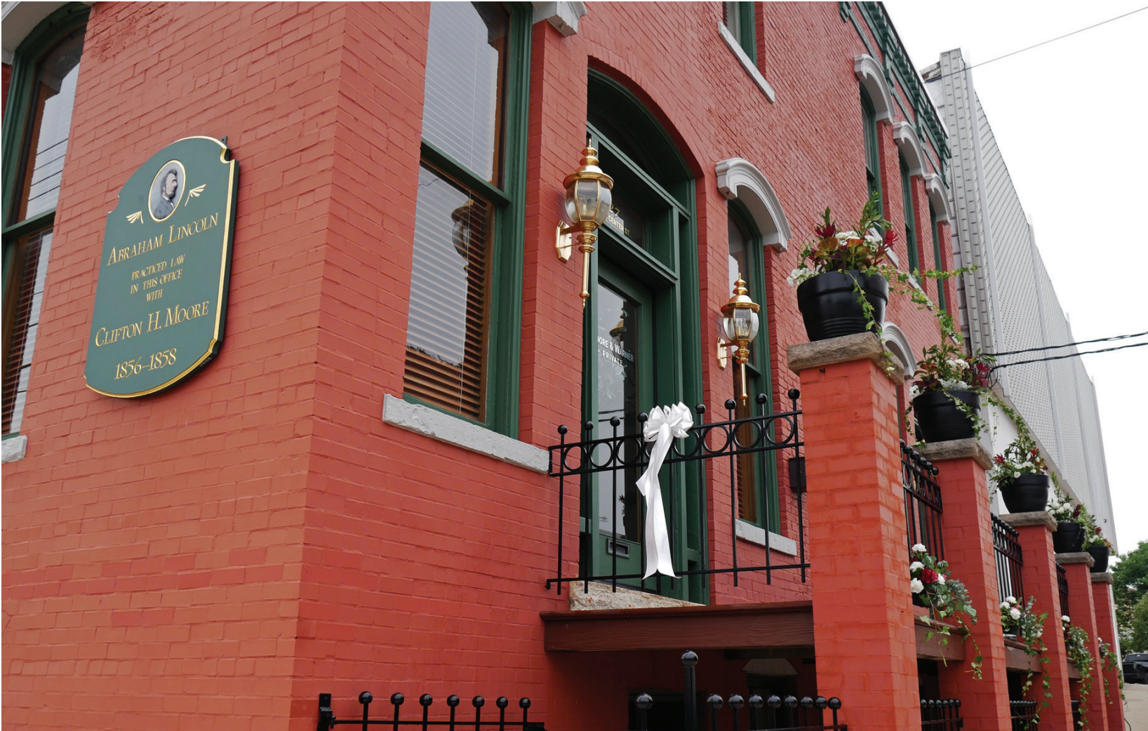
Gordon Woods / Journal