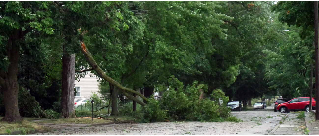
A limb came down along N. Jackson Street during the storm, partially blocking the street.