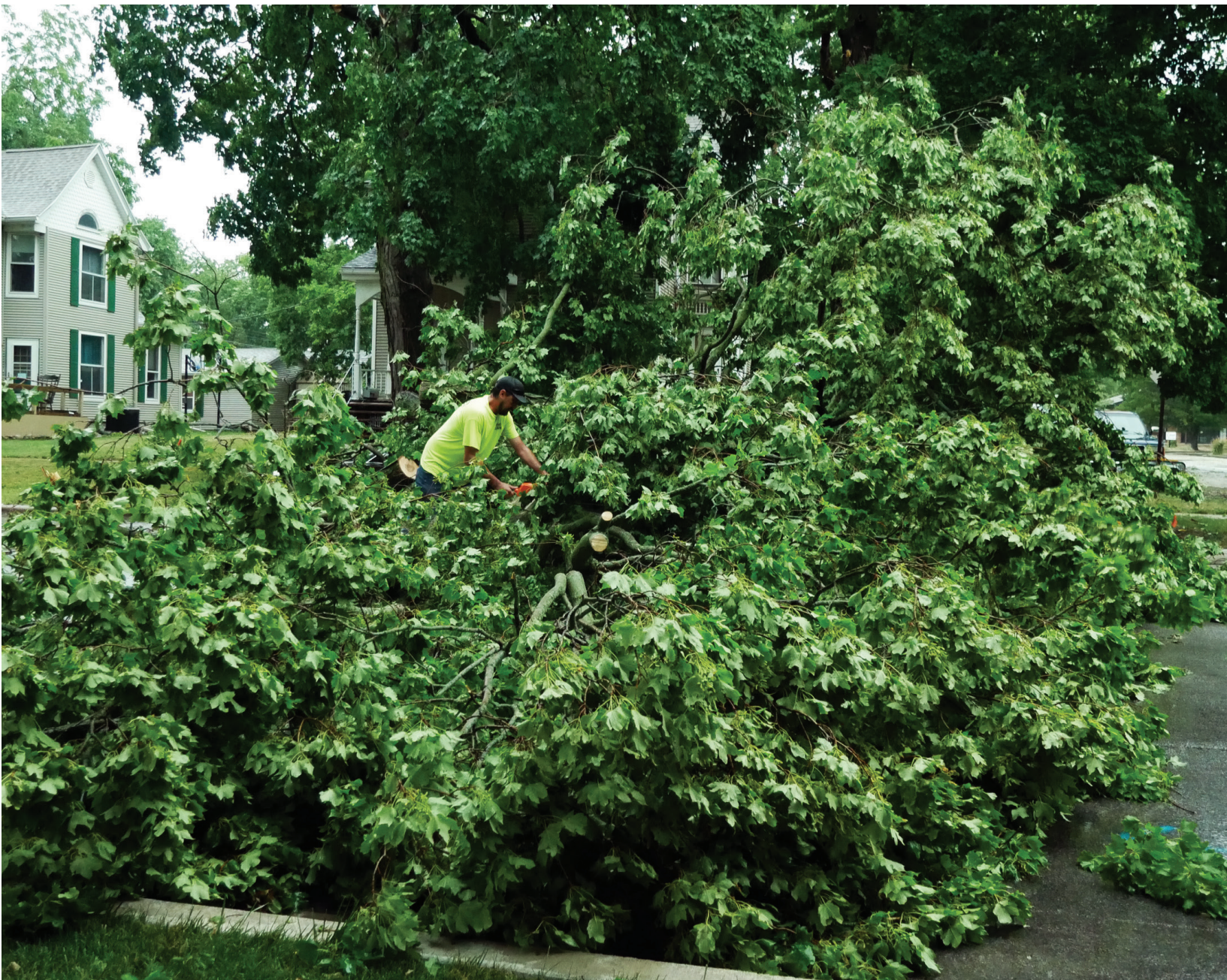
Gordon Woods / Journal City crews were out cleaning up and clearing fallen trees and tree limbs soon after the June 29 storm swept through the area. This tree fell across the 200 block of S. Center Street.