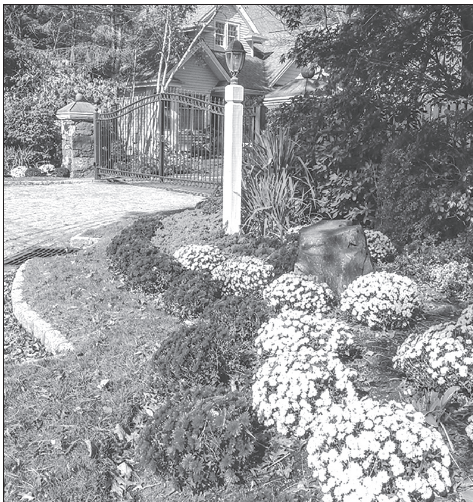
Fall planting and maintenance can extend gardening season and improve the chances of growing a healthy spring garden.

• Fill in landscaping gaps. Some fall plants can add color around the landscape and brighten up homes to add curb appeal. In addition to pansies and violas, asters,