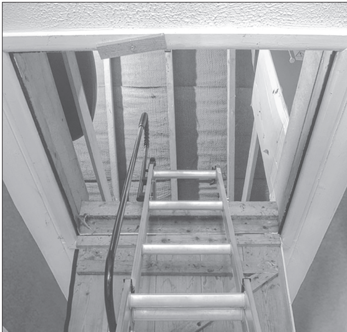
Homeowners who would like to convert attics into livable spaces need to take certain things into consideration before starting an improvement project.

Attic renovations can give homeowners more space in their homes, which can be used as offices, bedrooms or cozy corners. This is no small undertaking and all of the right steps need to be followed to ensure a legal, safe and successful renovation.