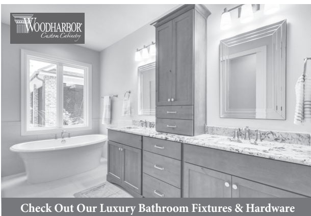
Check Out Our Luxury Bathroom Fixtures & Hardware

A home's flooring is bound to draw the attention of residents and visitors alike. Homeowners who replace their flooring can ensure that attention is drawn for all the right reasons.