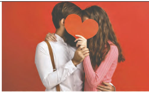
The Arizona Silver Belt's Cutest Couple Contest