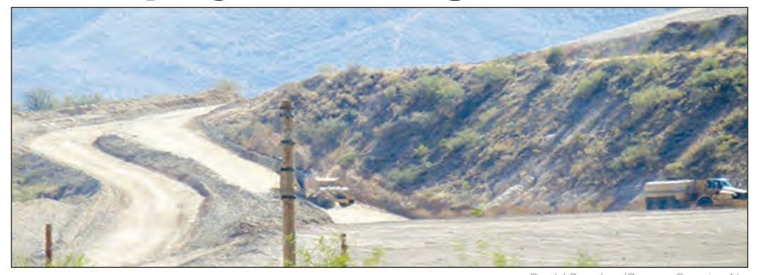
David Sowders/Copper Country New

Vehicles were at work last week on BHP's project to buttress the Solitude Tailings Facility south of Claypool and the Cobre Valley Regional Medical Center. The project's goal is to improve the tailings' resilience for stability during a 1-in-10,000-year seismic event. Though the facility is safe in current conditions, it could become unstable in the event of a catastrophic earthquake. The buttress, which is being constructed with native Gila conglomerate, is expected to provide more support and stability to the embankment slopes. The project is anticipated to use more than three million cubic yards of dirt and 150,000 cubic yards of rock armoring, sourced from a local quarry. Modeled on a successfully applied cover system approach BHP has used at the Miami Unit Tailings, San Manuel Tailings and San Manuel Heap Leach Facility, the project's landform/cover system design was four to five years in the making.