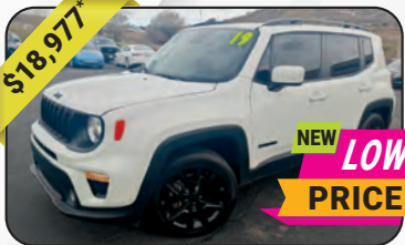
2019 Jeep Renegade Altitude FWD, Alpine White Clearcoat, Loaded, Reverse Camera, City:22 Hwy:30, 50,817mi, Stock # 6008