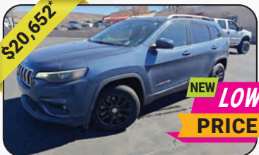
2020 Jeep Cherokee Latitude Plus FWD, 39,816mi, Slate Blue Pearlcoat, Loaded, Reverse Camera, City:23 Hwy:31, Stock # 5986