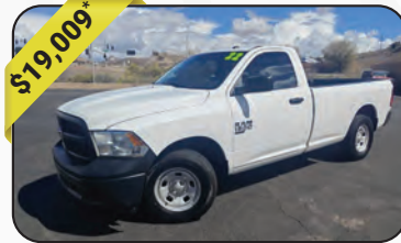
2022 Ram 1500 Classic Tradesman RWD, Bright White Clearcoat, Tow Package, Reverse Camera, 91,194mi, One Owner, Stock # 6025