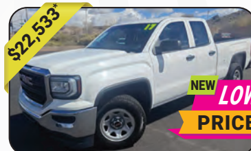
2019 GMC Sierra 1500 Limited RWD, V8, Loaded, Summit White, 99,138mi, Reverse Camera, Stock #6027