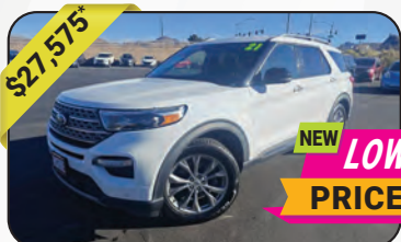
2021 Ford Explorer Limited Turbo, RWD, White, Loaded, Reverse Camera, 58,380mi, City:21 Hwy:28, Stock # 6021