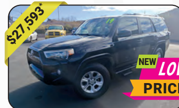
2019 Toyota 4Runner SR5 4WD, Black, Loaded, Reverse Camera, 96,018mi, City:17 Hwy:20, Stock #6015