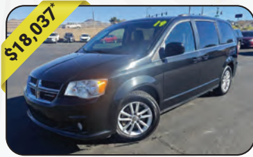
2019 Dodge Grand Caravan SXT Loaded, Reverse Camera, 40GB Hard Drive, Black Onyx Crystal Pearlcoat, FWD, City:17 Hwy:25, 64,957mi, Stock # 6020