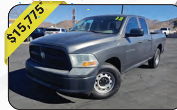
2012 Ram 1500 ST RWD, Loaded, Mineral Gray Metallic, 61,492mi, City:14 Hwy:20, Stock #5970