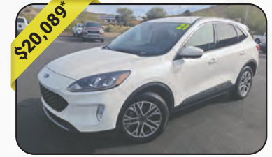
2021 Ford Escape SEL AWD, 21,246mi, Transmission w/Driver Selectable Mode and Oil Cooler, White, City:23 Hwy:31, Stock #5946