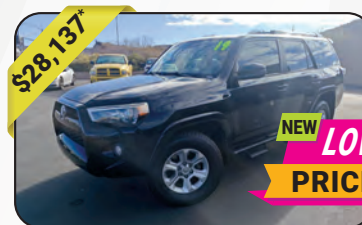
2019 Toyota 4Runner SR5 4WD, Black, Loaded, Reverse Camera, 96,018mi, City:17 Hwy:20, Stock #6015