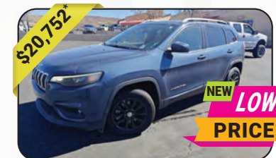
2020 Jeep Cherokee Latitude Plus FWD, 39,816mi, Slate Blue Pearlcoat, Loaded, Reverse Camera, City:23 Hwy:31, Stock # 5986