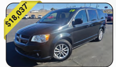
2019 Dodge Grand Caravan SXT Loaded, Reverse Camera, 40GB Hard Drive, Black Onyx Crystal Pearlcoat, FWD, City:17 Hwy:25, 64,957mi, Stock # 6020