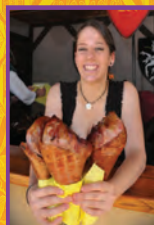
All day feasting!

SATURDAYS, SUNDAYS & PRESIDENTS' DAY • 10AM-6PM