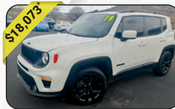
2019 Jeep Renegade Altitude FWD, Alpine White Clearcoat, Loaded, Reverse Camera, City:22 Hwy:30, 50,817mi, Stock # 6008