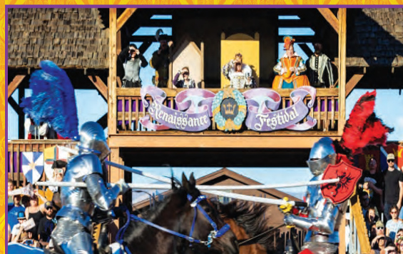
Cheer for your favorite knight!