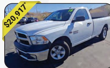
2018 Ram 1500 Tradesman RWD, Bright White Clearcoat, V-8, Loaded, Reverse Camera, 43,197mi, City:15 Hwy:22, Stock # 6006