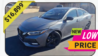
2022 Nissan Sentra SR FWD, Gray, Loaded, Reverse Camera, 76,582mi, City:28 Hwy:37, Stock # 5976