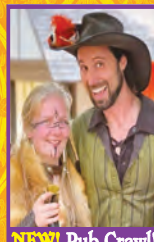
NEW! Pub Crawl!