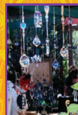
Over 200 craft shops!