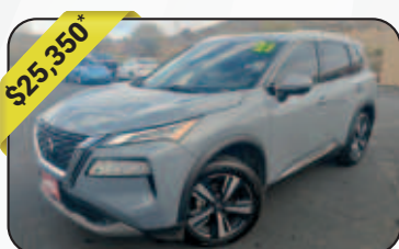
2021 Nissan Rogue SL FWD, Boulder Gray Pearl, Loaded, Moon/Sun Roof, Reverse Camera, 37,316mi, City:26 Hwy:34, Stock # 5977