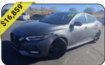
2022 Nissan Sentra SR FWD, Gun Metallic, Loaded, Reverse Camera, City:28 Hwy:37, 76,582mi, Stock # 5976