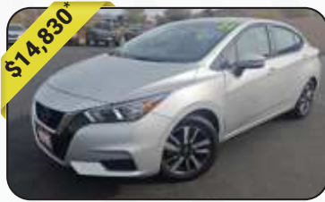
2021 Nissan Versa SV FWD, Loaded, Brilliant Silver Metallic, Reverse Camera, 65,990 mi, City:32 Hwy:40, Stock #5995