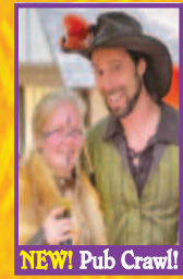
NEW! Pub Crawl!