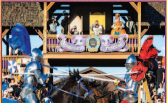
Cheer for your favorite knight!