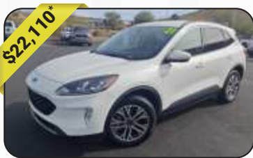
2021 Ford Escape SEL AWD, 21,246mi, Transmission w/Driver Selectable Mode and Oil Cooler, White, City:23 Hwy:31, Stock #5946