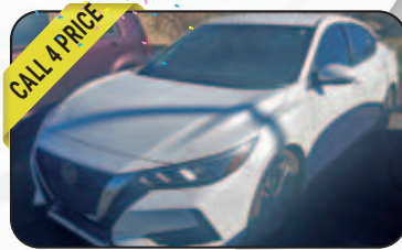
2020 Nissan Sentra SV FWD, 88,196mi, Blue, V8, Loaded, Tow Package, City:15 Hwy:21, Stock # 5989