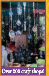
Over 200 craft shops!