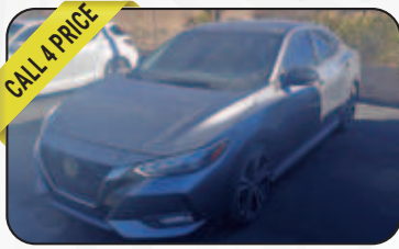
2022 Nissan Sentra SR FWD, Gun Metallic, City:28 Hwy:37, Loaded, Reverse Camera, 37,316mi, Stock #5990