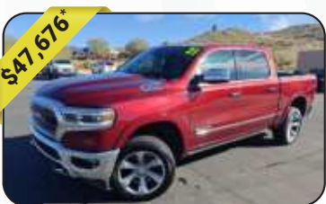
2021 Ram 1500 Limited Turbo Diesel, Delmonico Red Pearlcoat, 4WD, Trailer Tow Group, City:21 Hwy:29, 41,536mi, Stock # 5961