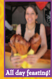
All day feasting!

NINE FESTIVE WEEKENDS FEBRUARY 3-MARCH 31 SATURDAYS, SUNDAYS & PRESIDENTS' DAY • 10AM-6PM