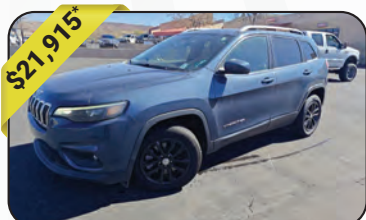
$21,915* 2020 Jeep Cherokee Latitude Plus FWD, 39,816mi, Slate Blue Pearlcoat, Loaded, Reverse Camera, City:23 Hwy:31, Stock # 5986