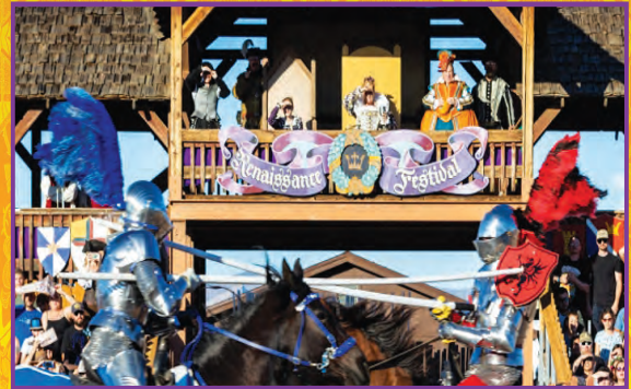
Cheer for your favorite knight!