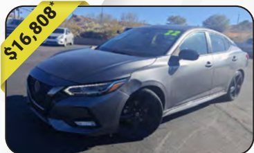
$16,808* 2022 Nissan Sentra SR FWD, Gun Metallic, Loaded, Reverse Camera, City:28 Hwy:37, 76,582mi, Stock # 5976