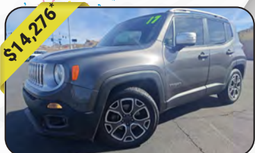
$14,276* 2017 Jeep Renegade Limited FWD, Granite Crystal Metallic Clearcoat, Loaded, 87,302mi, City:22 Hwy:30, Stock # 5983