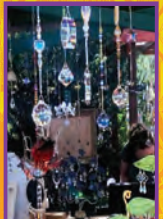
Over 200 craft shops!