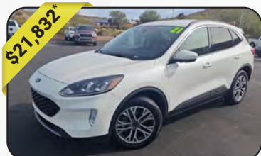
$21,832* 2021 Ford Escape SEL AWD, 21,246mi, Transmission w/Driver Selectable Mode and Oil Cooler, White, City:23 Hwy:31, Stock #5946