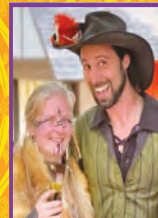
NEW! Pub Crawl!