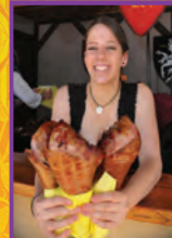
All day feasting!

NINE FESTIVE WEEKENDS FEBRUARY 3-MARCH 31 SATURDAYS, SUNDAYS & PRESIDENTS' DAY • 10AM-6PM