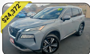
$24,372* 2021 Nissan Rogue SL FWD, Boulder Gray Pearl, Loaded, Moon/Sun Roof, Reverse Camera, 37,316mi, City:26 Hwy:34, Stock # 5977