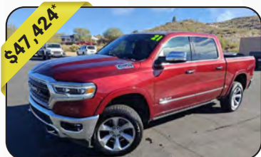
$47,424* 2021 Ram 1500 Limited Turbo Diesel, Delmonico Red Pearlcoat, 4WD, Trailer Tow Group, City:21 Hwy:29, 41,536mi, Stock # 5961