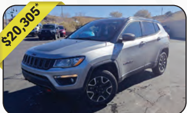
$20,305* 2021 Jeep Compass Trailhawk 4WD, Billet Silver Metallic Clearcoat, City:22 Hwy:30, Loaded, Reverse Camera, 61,198mi, Stock #5985