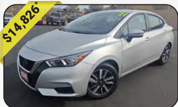
$14,826* 2021 Nissan Versa SV FWD, Loaded, Brilliant Silver Metallic, Reverse Camera, 65,990 mi, City:32 Hwy:40, Stock #5995