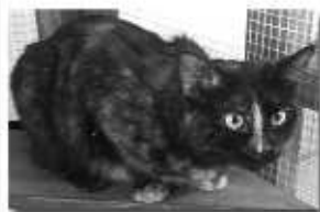
Trixie - Female

Meet Trixie! She is a DSH, black and orange in color. She was born on 2-1-18. Trixie is curious and playful. Come see her and the other cats available.