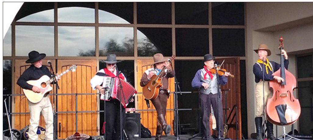
Pioneer Pepper and the Sunset Pioneers to perform at the 20th annual Gold Canyon Arts Festival on Jan. 25

The Gold Canyon Arts Council, a non-profit organization, brings world class concerts to the East Valley through its Canyon Sounds Performance Series. Their core mission is Student