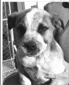
Hobo - Male