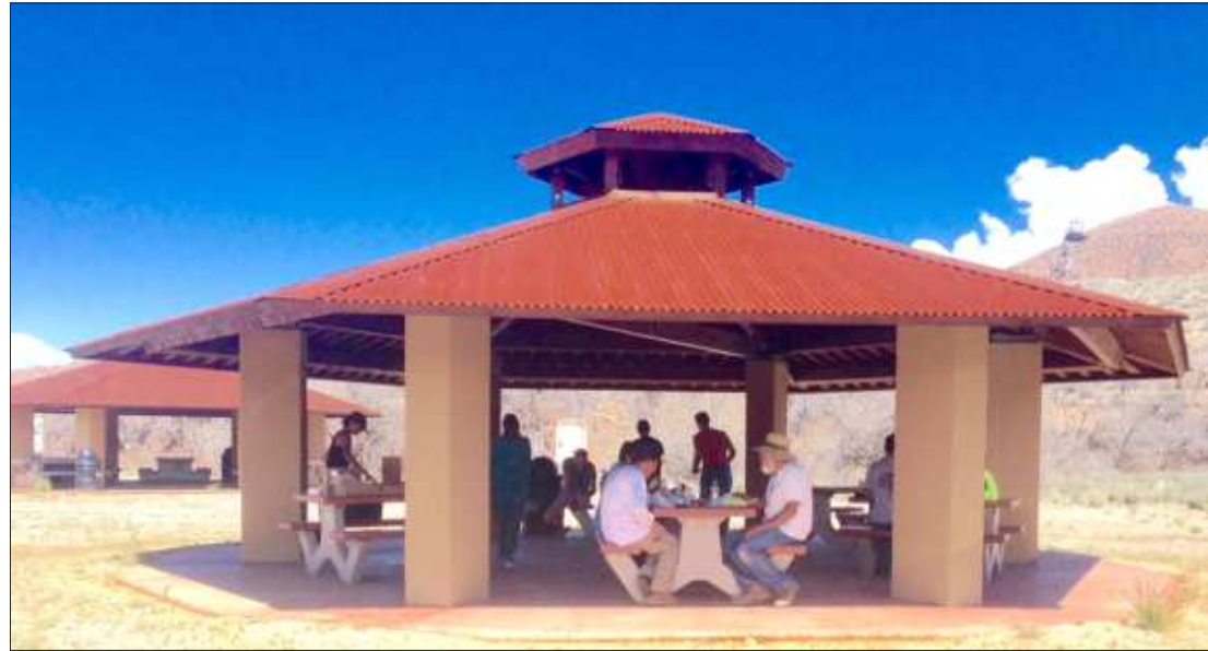
Picnic pavilions at the Old Dominion Mine Park.

Wednesday Hardscrabble programs are co-hosted by Gila County Historical Museum in Globe and Bullion Plaza Cultural Center and Museum in Miami.