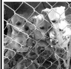
Curly, Mo & Larry

These pups are about 4 months old. 2 males and a female. They are Chihuahua mix. If you want to see these cute puppies and the other dogs we have come by the Humane Society.