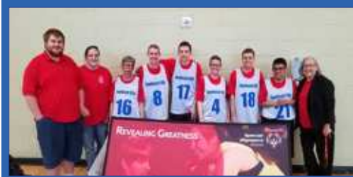
Team wins Silver page 11