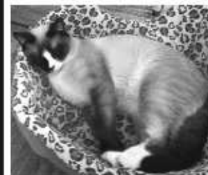
Osco - Male

Osco is a DSH Siamese Male. He was born on 4/13/2019. He is a beautiful cat.