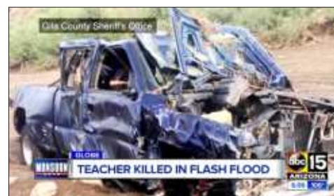
A devastating look at the damages to Cañez's vehicle.

24 percent chance for rain each day over the next week. Residents downhill and downstream of the Telegraph Fire should be particularly aware.