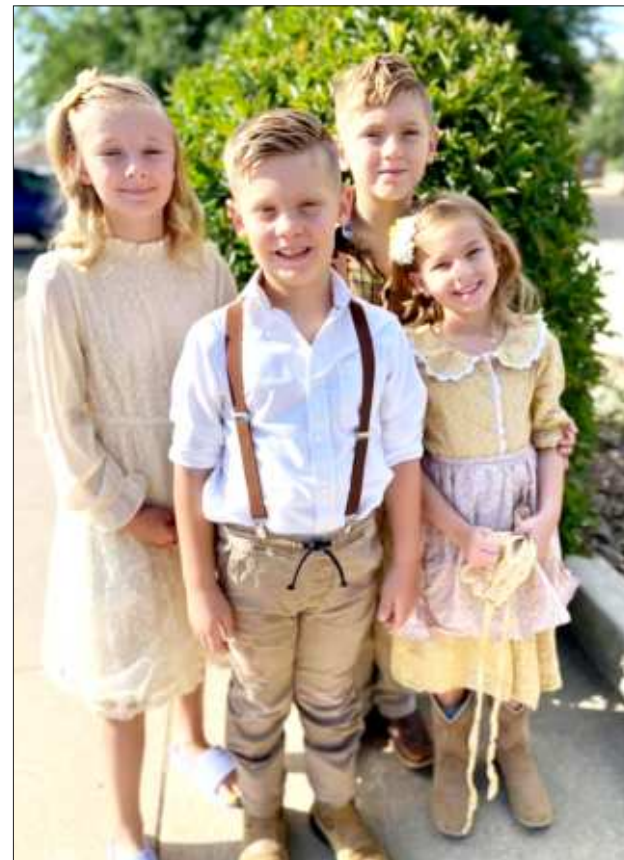
Find Yourself a Pretty Penny films in Globe

Volunteers fill thousands of sandbags to be distributed in Gila County.