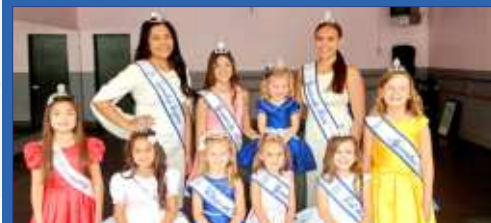
Cinderella Pageant Winners page 13