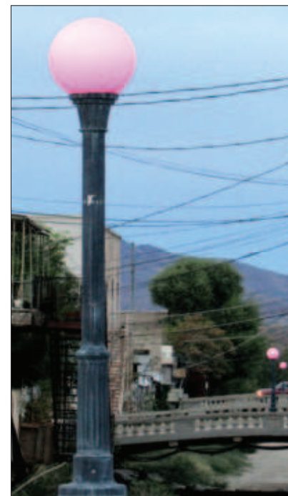
Miami's historic bridges are lit purple to observe Domestic Violence Awareness Month.

National Domestic Violence Awareness Month was first observed in October 1987, evolving from a 1981 "Day of Unity" conceived by the Na-