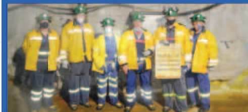
Miami Council visits Resolution page 9