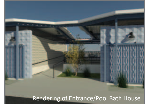
Rendering of Entrance/Pool Bath House