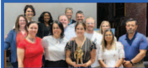
Moonshot winners page 10