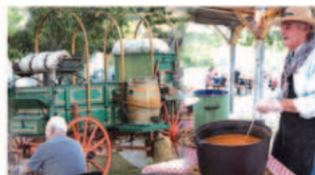
Chuck Wagon Grubs