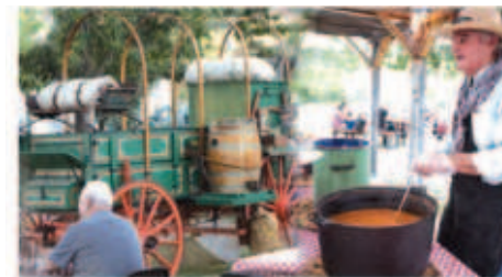
Chuck Wagon Grubs

Saturday, October 1 – Salute to Ranching