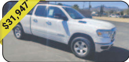
$31,947* 2020 Ram 1500 Big Horn V-8 5.7 L/345, 8-SPEED AUTOMATIC W/OD, RWD, 63,256mi, Bright White Clearcoat, Cty 15/Hwy 22, Stock # 5775