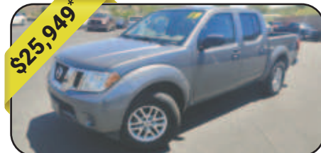
$25,949* 2019 Nissan Frontier SV V-4 4.0 L/241, 5-Speed Automatic w/OD, RWD, 66,292mi, Gun Metallic, Cty: 16/Hwy: 23, Stock # 5778