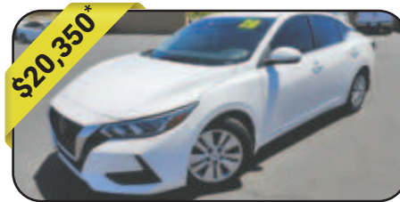
$20,350* 2020 Nissan Sentra S I-4 2.0 L/122, 1-SPEED CVT W/OD, FWD, 19,479mi, Fresh Powder, Cty 29/Hwy 39, Stock # 5763