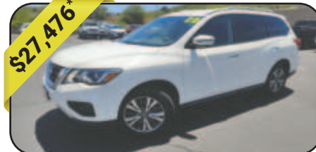
$27,476* 2020 Nissan Pathfinder SL V-6 3.5 L/213, 1-SPEED CVT W/OD, FWD, 68,936mi, Glacier White, Cty 20/Hwy 27, Stock # 5777