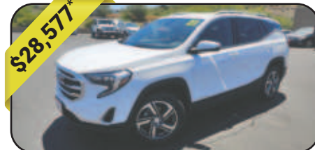
$28,577* 2021 GMC Terrain SLT Turbocharged 1.5L/92 9-Speed Automatic, AWD, 62,324mi, Summit White, Cty 25/Hwy 28, Stock # 5770