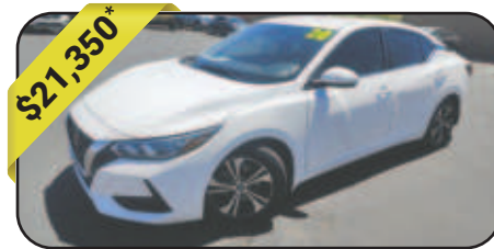
$21,350* 2020 Nissan Sentra SV I-4 2.0 L/122, 1-SPEED CVT W/OD, FWD, 35,155mi, Fresh Powder, Cty: 29/Hwy: 39, Stock # 5764