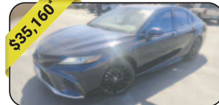
$35,160* 2021 Toyota Camry XSE I-4 2.5 L/152, 8-Speed Automatic w/OD, FWD, 13,114mi, Dark Blue, Cty 27/Hwy 38, Stock # 5747