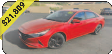
$21,809* 2021 Hyundai Elantra SEL I-4 2.0 L/122, 1-SPEED CVT W/OD, FWD, 61,917mi, Calypso Red, Cty: 31/Hwy: 41, Stock # 5771