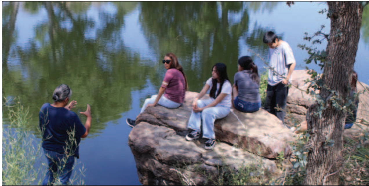
Summer Youth Program students at Seneca Lake.