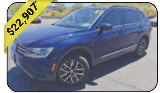
2021 Volkswagen Tiguan SE Sport Mode, FWD, 26,622mi, Towing Package, Blue, Cty 23/Hwy 29, Stock #5863