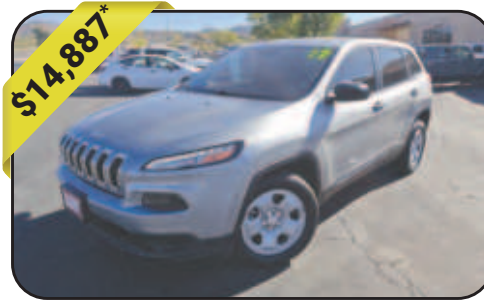
2017 Jeep Cherokee Sport FWD, Billet Silver Metallic Clearcoat, City:21 Hwy:30, 89,820mi, Stock # 5919