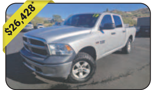
2017 Ram 1500 Tradesman Remote Keyless Entry w/All-Secure, 4WD, Bright Silver Metallic Clearcoat, 48,960mi, City:15 Hwy:21, Stock # 5899