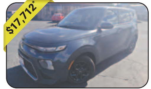
2021 Kia Soul S FWD, Gravity Gray, 62,245mi, City:29 Hwy:35, Black Cloth Seats, Stock # 5940