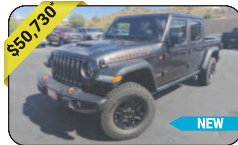
2023 JEEP GLADIATOR MOJAVE Trailer Tow Package, 4WD, Mopar Spray Bedliner, Granite Crystal Metallic Clearcoat, Stock #230157