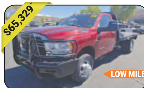
2023 Ram 3500 SLT Turbo Diesel, 4WD, 4,281mi, Delmonico Red Pearlcoat, Trailer Brake Control, Remote Start, Cty 28/Hwy 39, Stock # 5876

Horne Dodge • Chrysler • Jeep • Nissan 2046 E. Hwy 60 • Globe 888-535-5588 • 928-615-6585