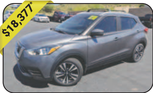
2020 Nissan Kicks SV Center Armrest w/storage, Gun Metallic, Vehicle Dynamic Control, 47,926mi, City:31 Hwy:36 Stock # 5822