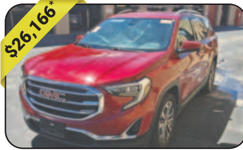
2020 GMC Terrain SLT Turbocharged, AWD, Red Quartz Tintcoat, All Season Tires, Stock # 5897