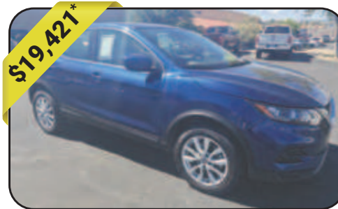
2021 Nissan Rogue Sport S AWD, Caspian Blue Metallic, Vehicle Dynamic Control, Cty 24/Hwy 30, Stock # 5905