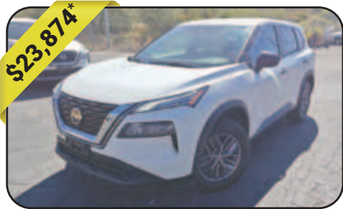
2021 Nissan Rogue S FWD, Glacier White, City:27 Hwy:35, 48,152mi, Stock # 5912