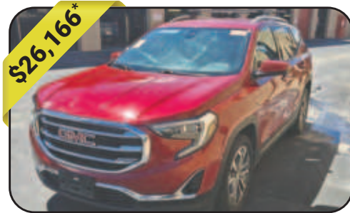
2020 GMC Terrain SLT Turbocharged, AWD, Red Quartz Tintcoat, All Season Tires, Stock # 5897