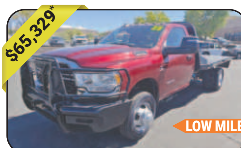
2023 Ram 3500 SLT Turbo Diesel, 4WD, 4,281mi, Delmonico Red Pearlcoat, Trailer Brake Control, Remote Start, Cty 28/Hwy 39, Stock # 5876