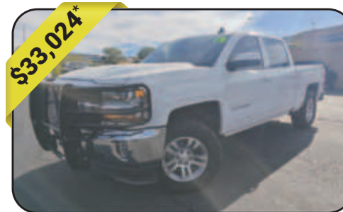
2018 Chevrolet Silverado 1500 LT Trailer Package, 4WD, Summit White, 81,459mi, City:16 Hwy:22, Stock # 5942