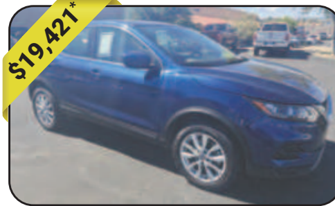
2021 Nissan Rogue Sport S AWD, Caspian Blue Metallic, Vehicle Dynamic Control, Cty 24/Hwy 30, Stock # 5905