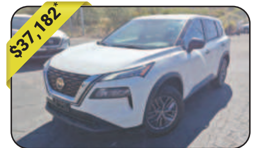
2020 Toyota 4Runner SR5 Variable Intermittent Wipers w/Heated Wiper Park, 4WD, Silver, City:16 Hwy:19, 54,643mi, Stock # 5931