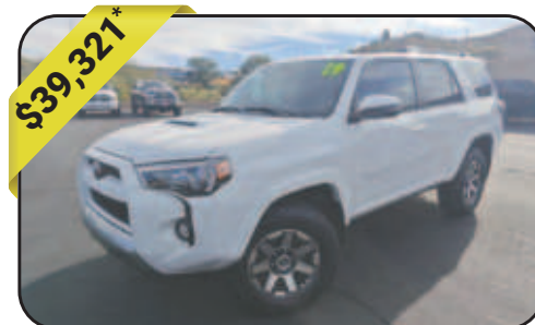
2019 Toyota 4Runner TRD Variable Intermittent Wipers w/Heated Wiper Park, 4WD, White, City:17 Hwy:20, 44,674mi, Stock #5948