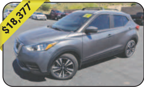
2020 Nissan Kicks SV Center Armrest w/storage, Gun Metallic, Vehicle Dynamic Control, 47,926mi, City:31 Hwy:36 Stock # 5822