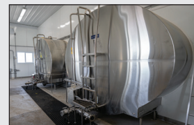
Milk Cooling & Storage