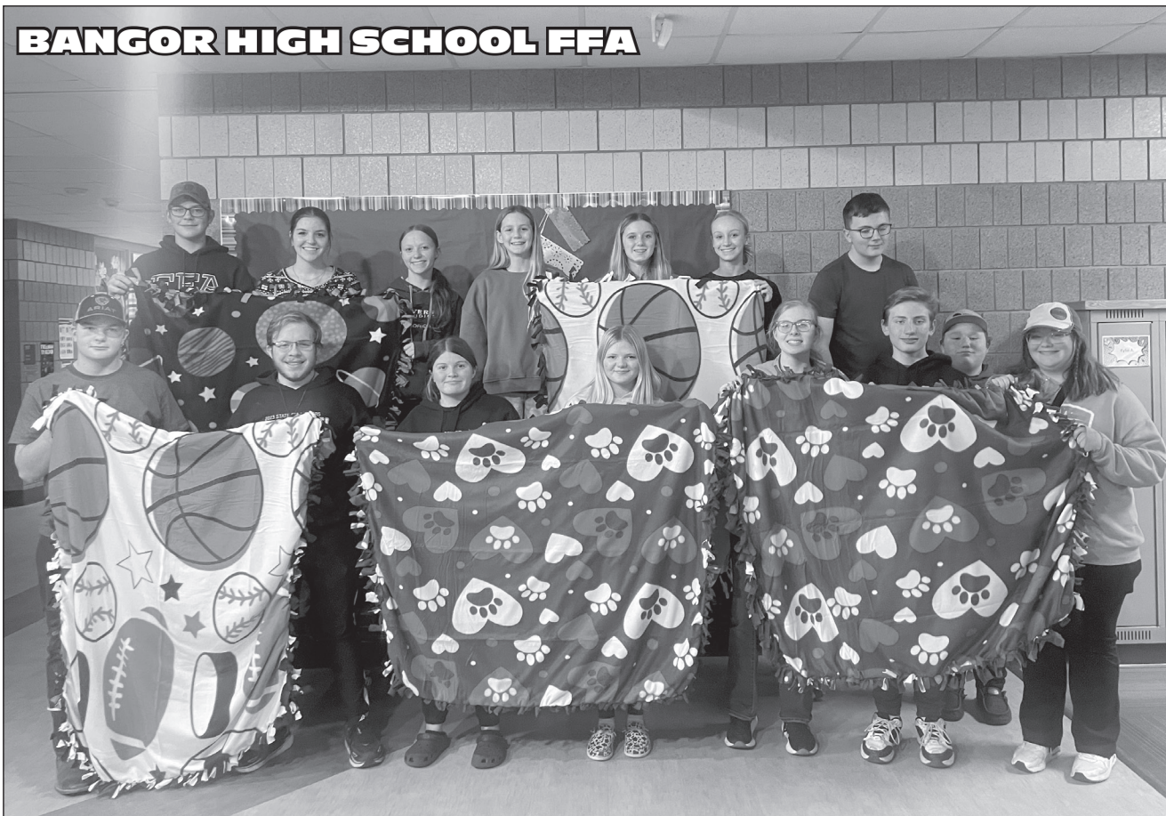
For the December chapter meeting, Bangor FFA members worked together to make tie blankets that were donated to a local hospital to be shared with patients.