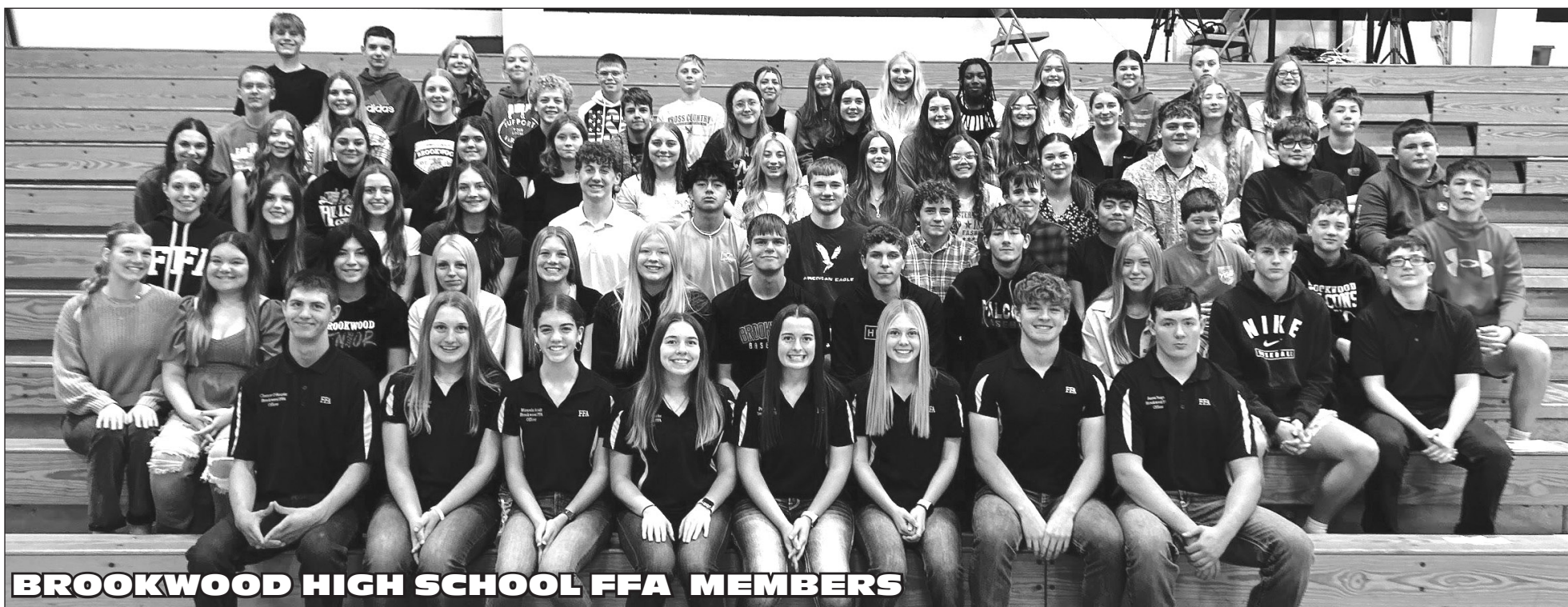
BROOKWOOD HIGH SCHOOL FFA MEMBERS