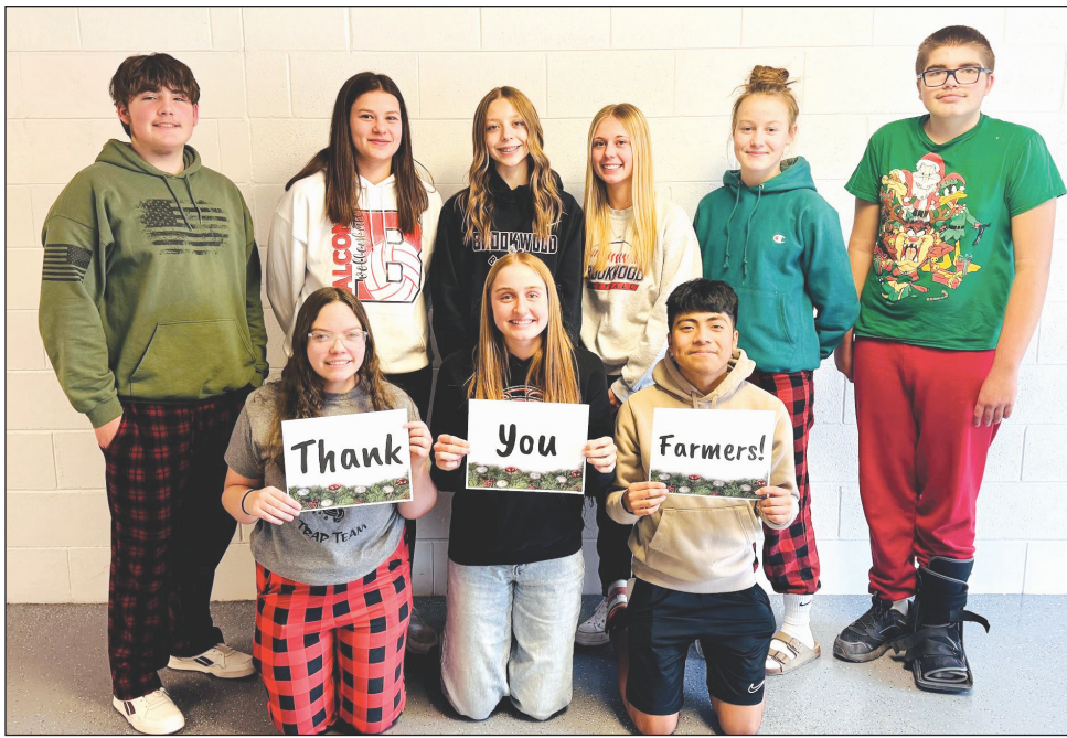
The Leadership Class assembled and delivered gift baskets for local farmers around Christmas time, as their community service project. Contributed photo.