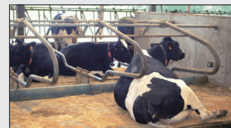
Waterbeds & Cow Comfort

Now also carrying Animal Health products!