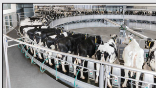
Milk Harvesting Solutions