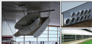
Ventilation & Climate Control