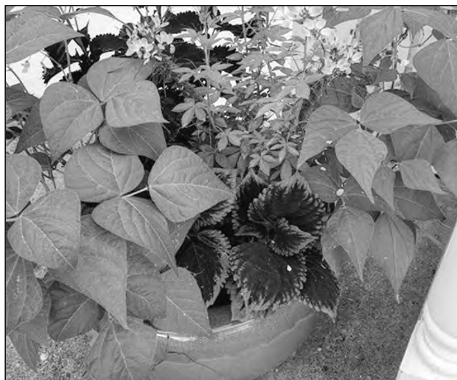
Bush style green beans in container 2021.