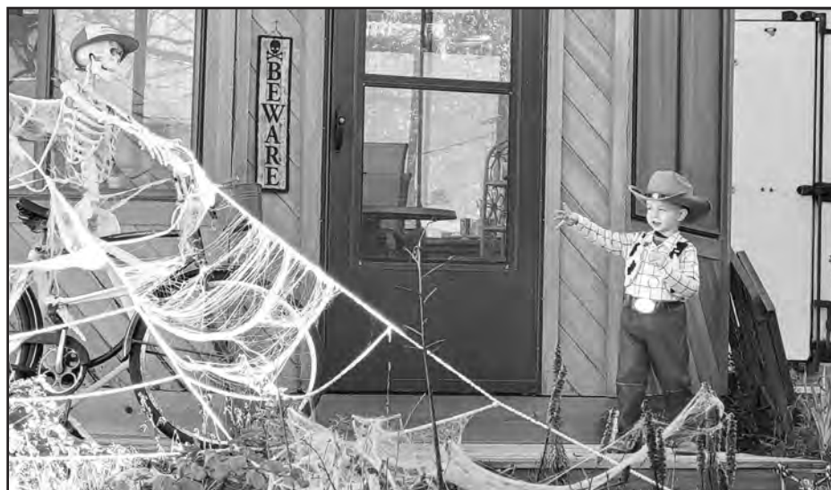
(additional pictures on page 6)