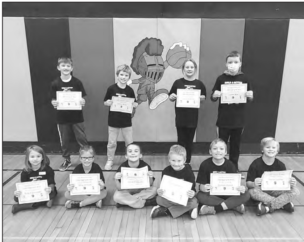
K-W Noble Knights of the Week for November 5, 2021