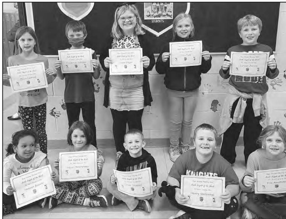
K-W Noble Knights of the Wee for October 15, 2021