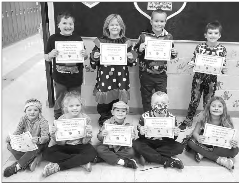
K-W Noble Knights of the Week for October 29, 2021