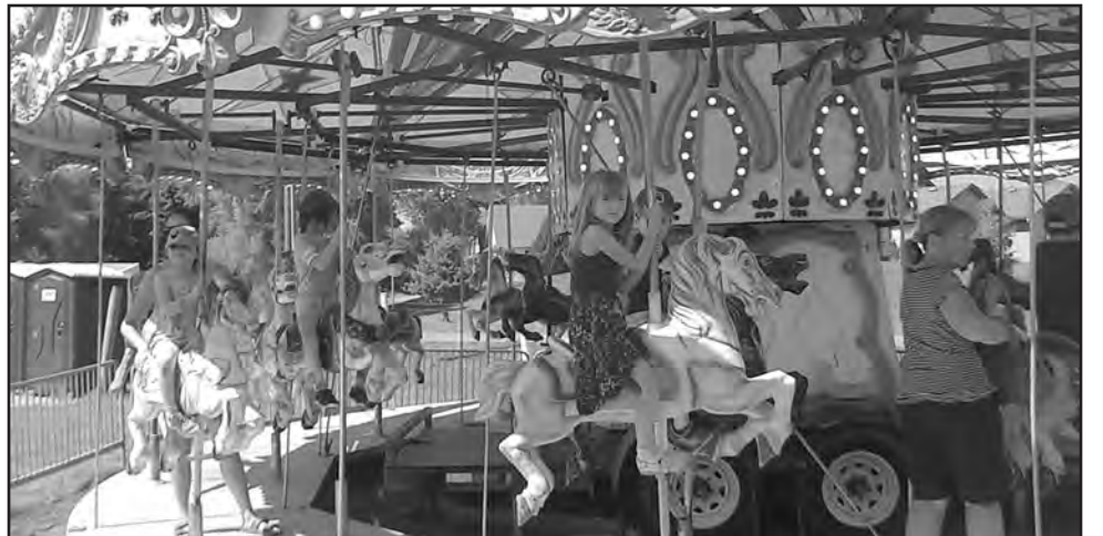
Carnival rides at the Midway