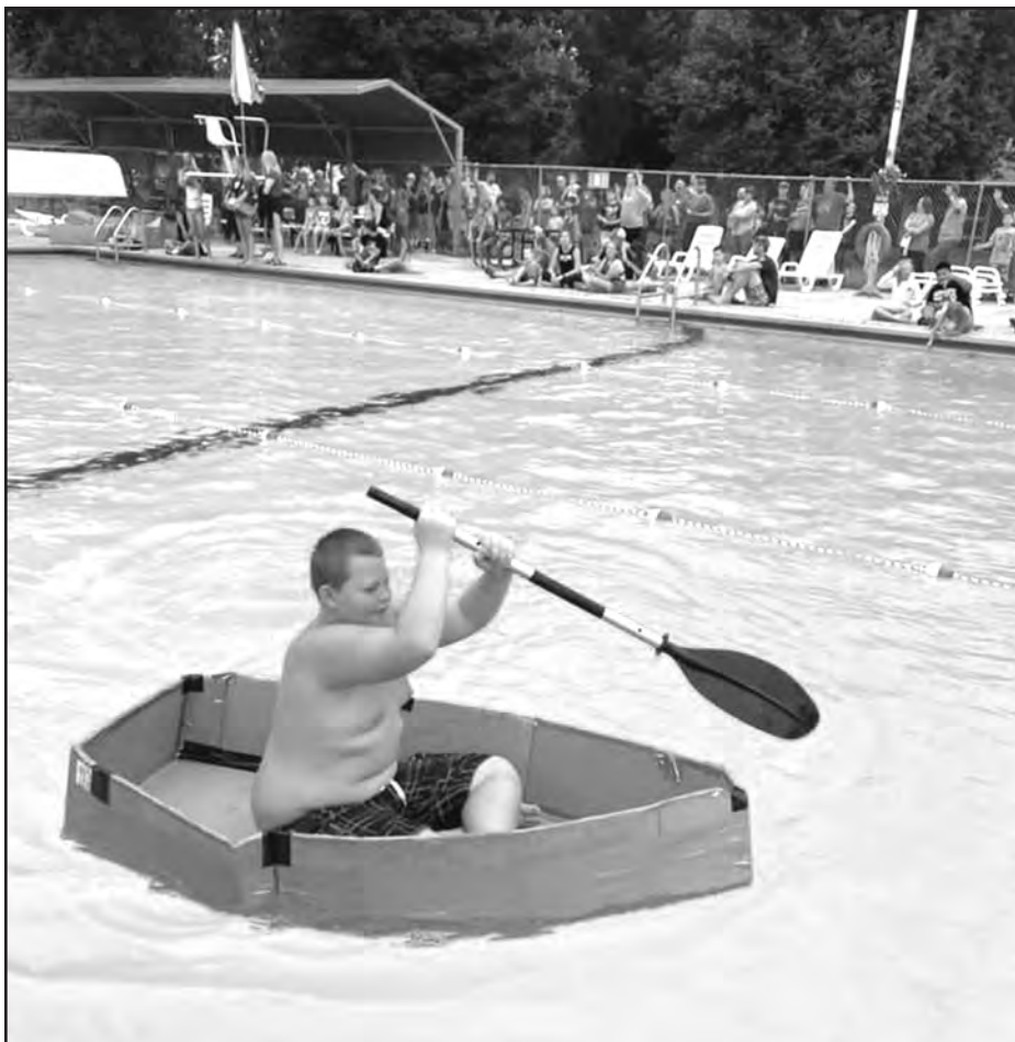
RoseFest Regatta featured boats built out of cardboard and duct tape