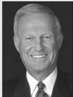
By Harvey Mackay

Comedy writer Bob Orben had an interesting take on customer service: "You go to a coin-operated store and wash and dry your clothes. Then you go to a filling station where you pump your own gas. And on to a fast-food restaurant where you carry your own tray. And what is it being called? A service economy!"