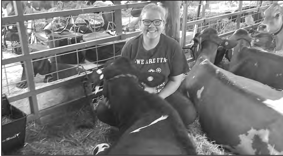
Proud to show her dairy calf