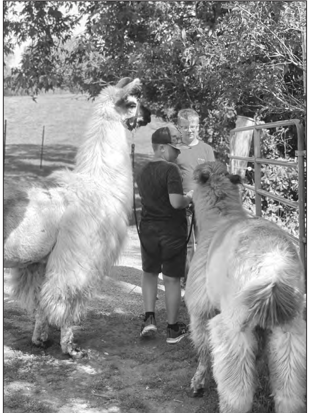
7477 400th Street Dennison, 713-244-4184 (cell) and check the Harvest Hill Acres Facebook page for daily updates!

This free event will happen rain or shine Saturday Oct 2 9-5:00 and Sun Oct 3 9-3:00! Bring your masks for inside buildings, your family for fun and food, and maybe bring your mama to meet those Llamas!!!