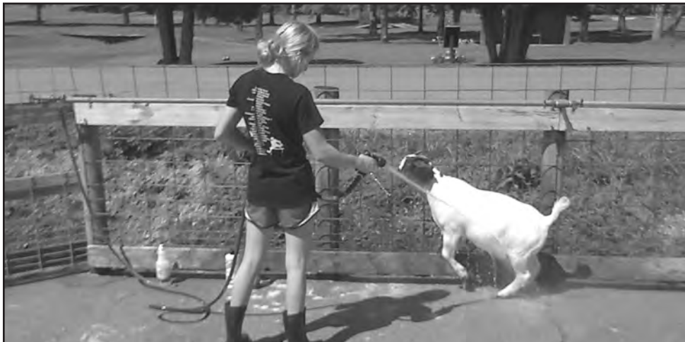
Goat washing before show