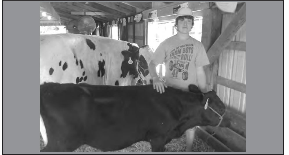
Farm boy with dairy calf