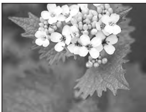
Garlic mustard flower