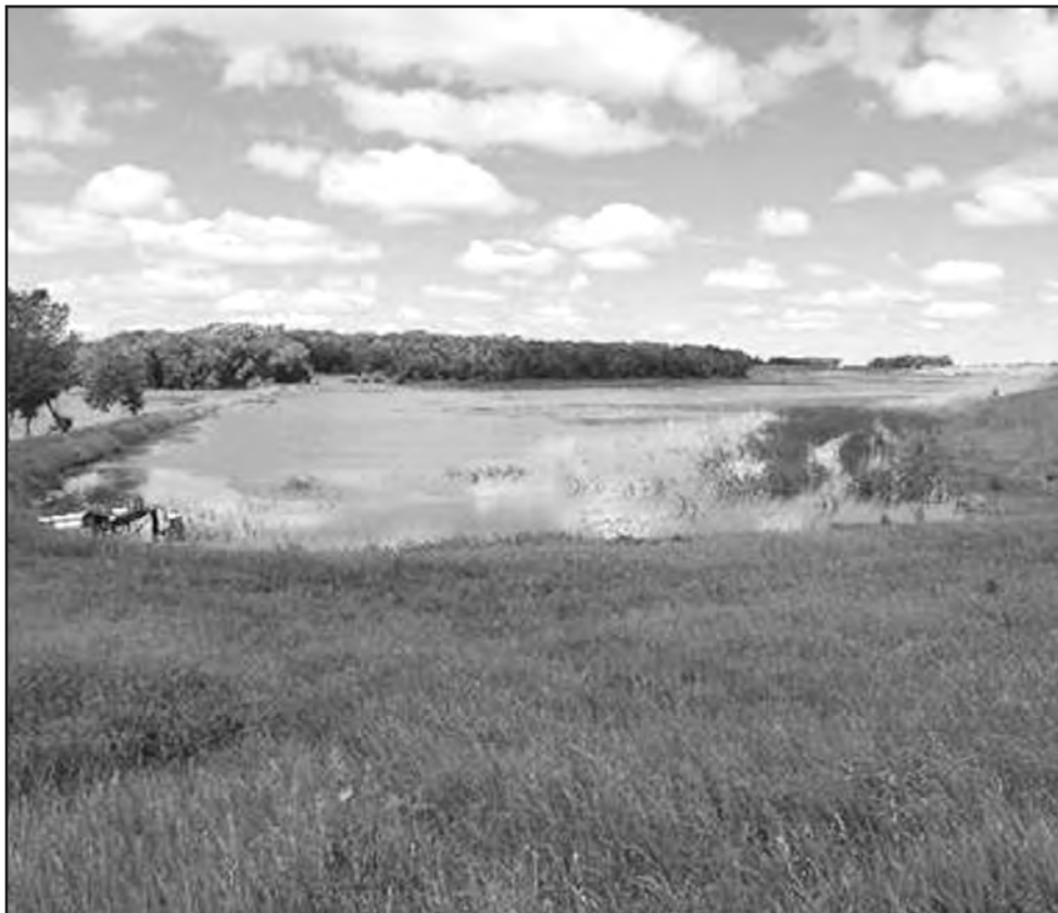
New CREP easement off County Road 46. Water has flooded the field since the tile pumps have been turned off. The pumps will be turned on this summer, drying up the site and construction will begin to fully restore the wetland. (May 2021.)

One may say that nothing further needs to be done to restore the land back into a wetland, but to truly achieve the highest potential the land has for flood mitigation, restored hydrology, and wildlife habitat some assistance is needed. This means breaking the berm and draining the wetland. Once all the water is drained, construction will begin by pulling tile from neighboring fields up and outlet into the wetland to make sure those fields not enrolled are functioning properly, reconstruction of the berm to allow water access into and out of the wetland depending on stream conditions, and engineering of safe crossings for the landowners to have access to the whole site for maintenance.