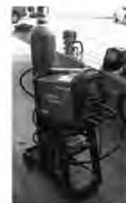
Pictured: Lincoln MIG