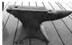
Pictured: Sheffield Anvil