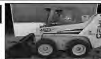
Gehl 4835 SXT turbo

Live On-Line bidding available at www.proxibid.com/holland