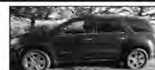
'15 GMC Acadia Denali

• 2015 GMC Acadia Denali, 39,417 miles, 2 sunroofs, like new tires, (one owner) • 1992 Jeep Cherokee Laredo, 4x4, 6 cyl., 193,000 miles • 1995 GMC Sierra SL 2500 pickup, 126,995 miles, ext. cab • 1955 Buick Century, shows 108,661 miles, 4-door, V-8 engine, like new tires, been restored • Gehl 4835 SXT turbo, shows 1076 hrs, diesel, heat, w/66" bucket • International 464 utility, shows 3712 Hrs, 3pt., gas, S.N.2210160U105638 • Ford Golden Jubilee, 3pt. • Ford 8N w/overdrive • J.D.A., N.F., S.N.665744 • A.C. WD45, turf tires, W.F., 3pt., S.N.169344 • A.C. WD45, W.F., rear weights, 3pt., S.N.199402, A.C. WD45, W.F., rear weights, S.N.151318 • A.C. WD45, W.F., rear weights, w/loader, S.N.226719 • J.D. TX Gator, Electric Box 2x4 • J.D. 345 mower, shows 508 hrs, 20 HP, liquid cooled, w/48" deck • Wizard 12 1/2 H.P. mower, w/42" deck • 2000 Yamaha Kodiak ATV, 400cc, 4x4 • 2008 P.J. 6 1/2' x 12' single axle trailer, w/drop ramp • 62" x 8' single axle trailer w/drop ramp • Ford 6' 3pt. grader blade • 48" skid loader forks • Woods 6' rotary cutter, 3pt. • Fordson 2 bottom x 14" plow, 3pt. • Flare box w/gear • Coleman powermate generator, 5000 watt, 10 HP • B.S. transfer pump • North Star power washer, Honda engine • Cambell Hausfeld upright compressor, 60 gal., 6 HP • Lincoln 225 amp welder • Smaller drill press • 300+500 gal. fuel barrels on stands • Round bale feeder • 10' feed bunk • 3 cattle pipe gates • Misc. hand and shop tools