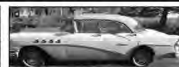
1955 Buick Century