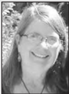
By Pastor Colleen Hoeft

Do you remember the game Whack-a-Mole? In Whack-a-Mole these moles pop up out of holes and you take this hammer, and you slam it back down. As soon as you slam one down what happens? Another one comes up. It goes on and on and on. The thing about this game - and this is why it's evil - is you can't win it. No matter how many you slam down they keep coming back up. And pretty soon you just give up and you walk away. You can never permanently whack down a mole- they always come up again.