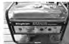
Pictured: King Craft Generator