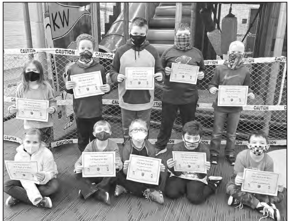
K-W Noble Knights for March 5, 2021