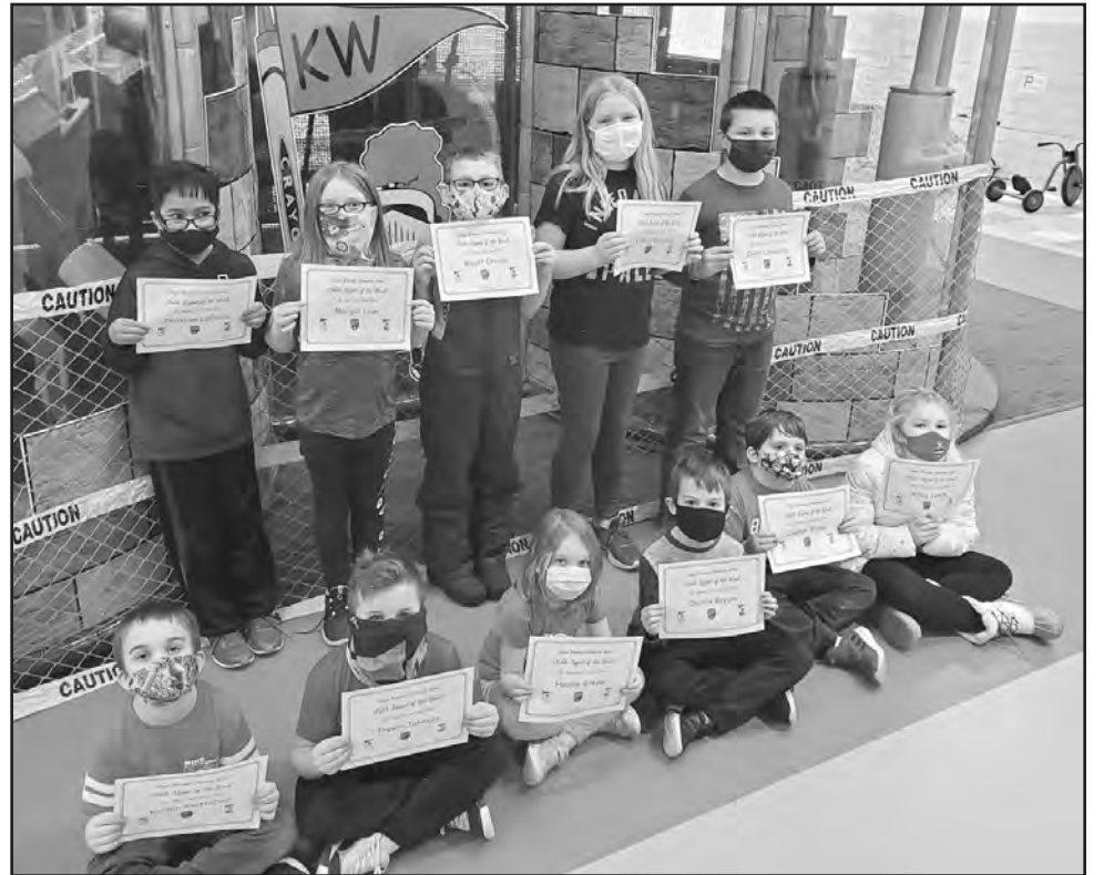
K-W Noble Knights for February 19, 2021