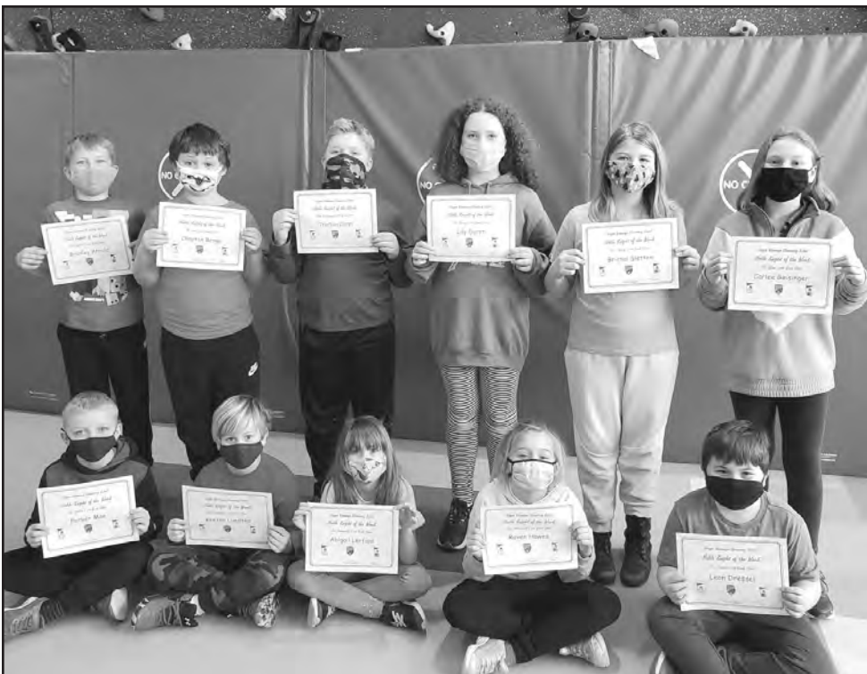
K-W Noble Knights for February 26, 2021