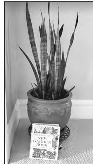
Mother-in-law tongue 2020 aka Sansevieria