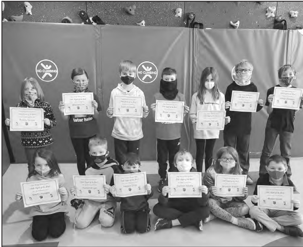
K-W Noble Knights for February 12, 2021